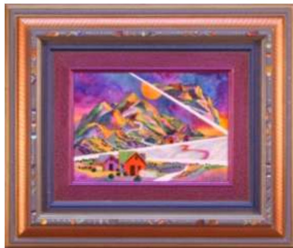
One of Fran's unique paintings

Steve's studio, graced by rhododendrons, flowering trees, and sculptures, is spacious and naturally lit. Walking trails lead to the dunes or around Marr Lake. Lunches are included in the workshop fee.