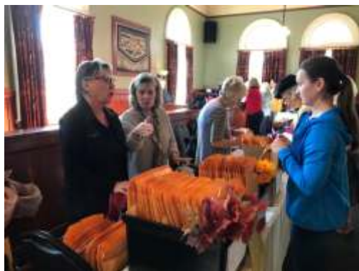
The Hospitality Table was a beehive Friday afternoon.