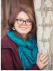
By Elizabeth Zimmerman

There were a couple bumps along the road planning for the 2017 Fall Convention. But everything