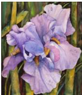
Charlotte Peterson's "Purple Rain #1"