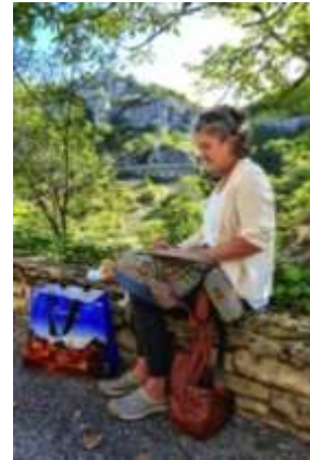
She emphasized stopping often to see and record while you travel.