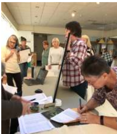
WSO members arriving with their accepted paintings