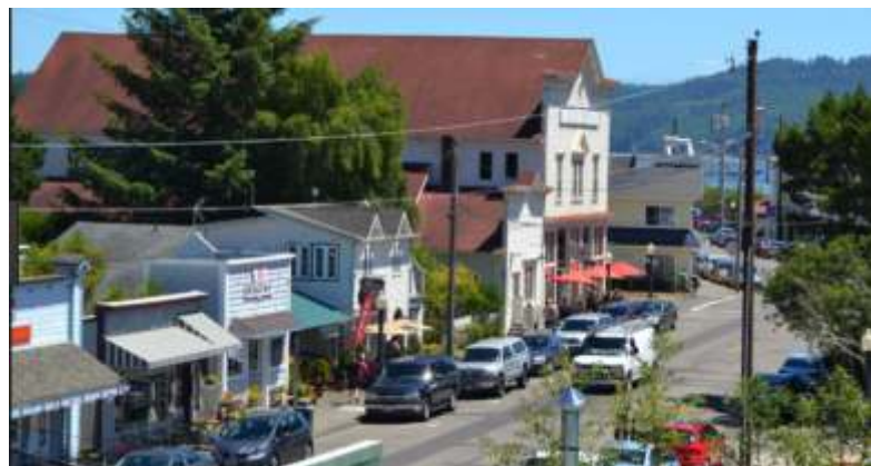
You'll have a great time exploring the shops, restaurants and galleries of Old Town Florence.