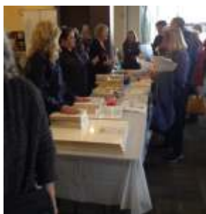
American Easel displayed their line of Cradled Birch panels.