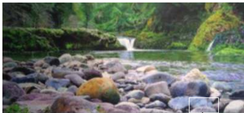
Above is the mystery painting and to the right a zoomed in image of the signature.