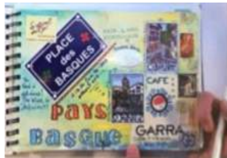
A page from one of Jacqueline's Journaling books reveals a combination of colored tape, found printed pieces, and some creative painting.

Her presentation was practical as well. We painted shipping tags