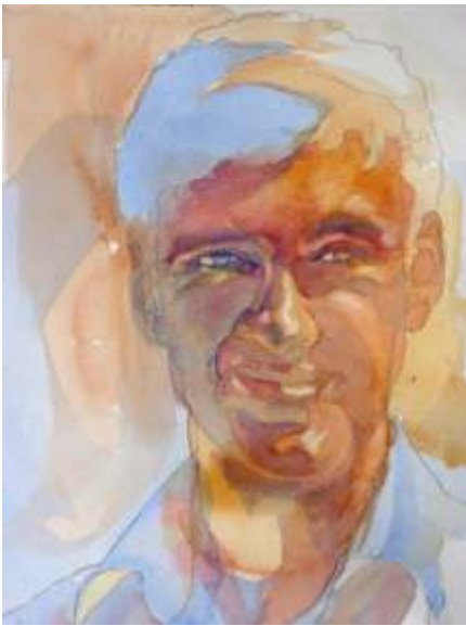
Sue Parman's painting "Blue Boy"