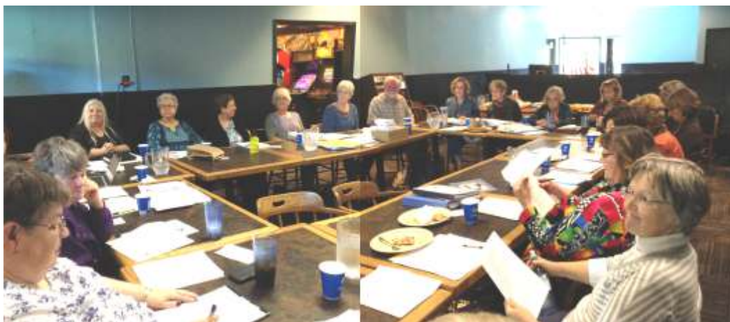
At 1 pm on Friday the WSO Board met at Wall Street Pizza in Gresham. Good Pizza!!