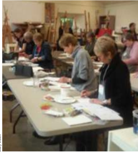
WSO members got to experiment with many varieties of Golden's aquamedia products.

I was particularly interested in Golden's Lift Aid fluid medium; when it is applied to surfaces, it improves the ability to lift watercolors. It can be applied to paper before painting or between washes without compromising the quality of the paper. This is one I definitely will try.