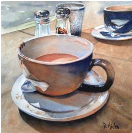
Dianne Hicks' painting "Coffee Break"