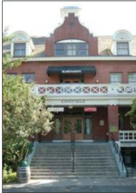
McMenamins Edgefield Hotel