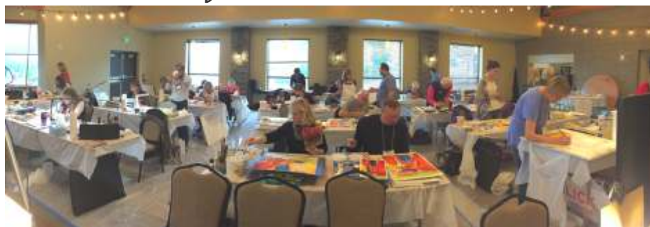
The workshop was held in a spacious room at the Harvest Christian Church in Troutdale.