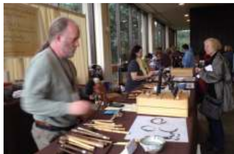
This gentleman had an awesome selection of brushes that he personally made by hand.