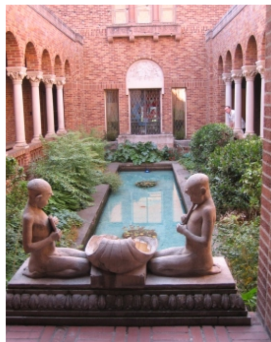
The 2017 WSO Spring Show and the 2017 WFWS Exhibition will held at The Jordan Schnitzer Museum on the U of O campus.