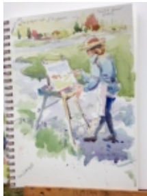
Vernon Groff's Sketch of Leslie

out sponge and dipped a corner of it into the paint she chose for her treetops. Then she gently dabbed on the paint and soon it resembled far-away treetops. Also during the morning while Leslie painted the garden Vernon Groff was busy painting a wonderful painting of Leslie.