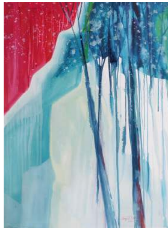
Sally Bills Bailey, Mt. Hood Icescape , 28 x 36, $1200