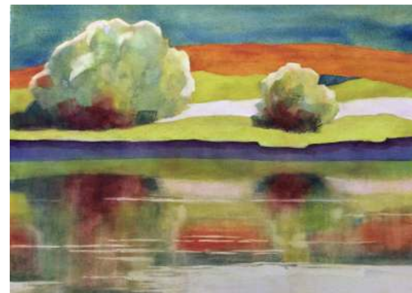
Karen Kreamer, Philomath Pond at Finley 16 x 20, $350