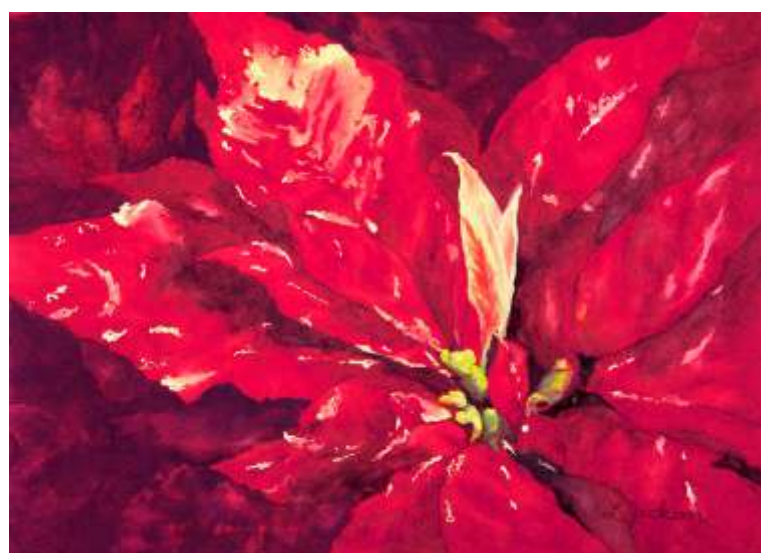
Lorry Jackson, Gresham, Poinsettias , 18 x 22, $500