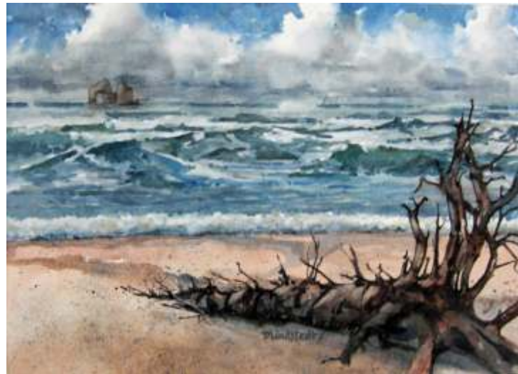
Doreen Lindstedt, Rockaway Passing Storm , 20 x 25, $800