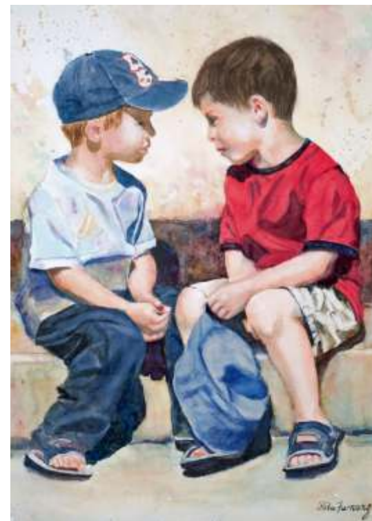
Rita Furnanz, Lake Oswego Eye to Eye , 23 x 19, $850