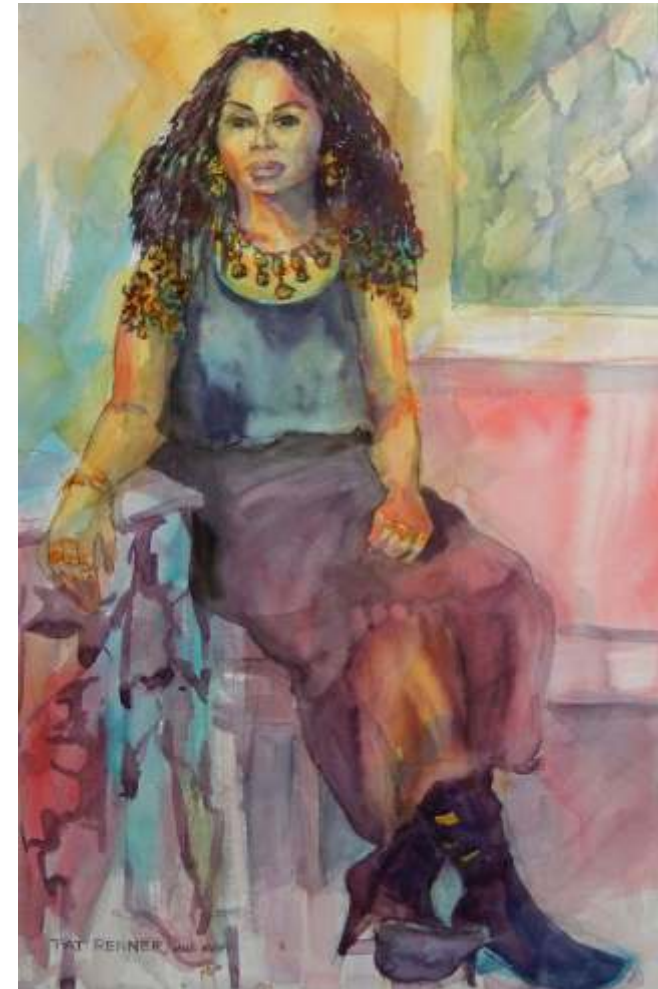
Patricia Renner, Gold Beach Almost Transparent, 27 x 21, $1200