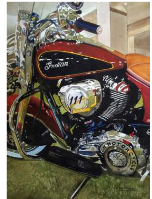
Kris Preslan, Lake Oswego Indian #2, 29 x 24, $1200