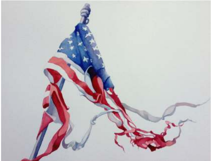
LaVonne Tarbox-Crone, Eugene State of The Nation , 29 x 37, $800

6th Place - Crater Lake Regional Award $250.