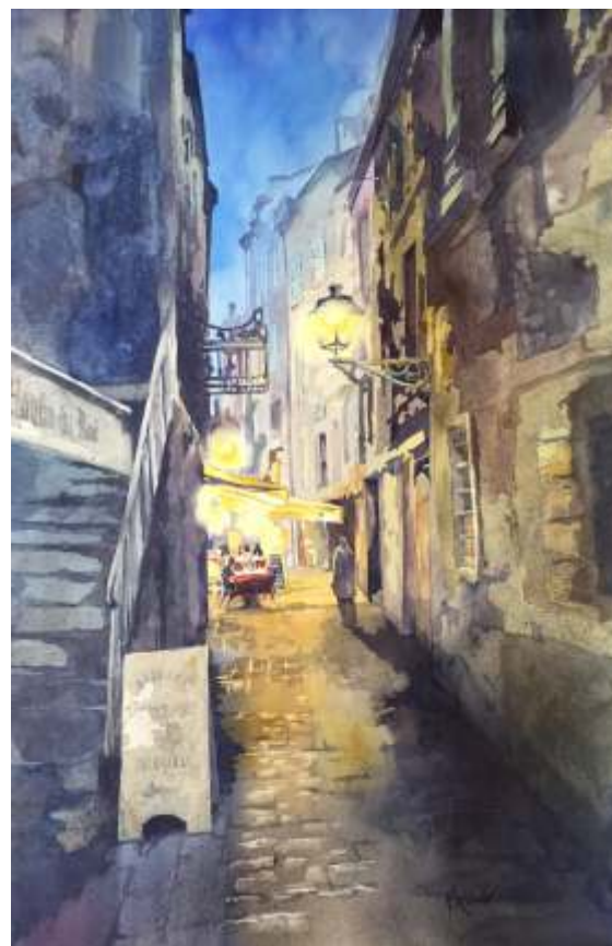
Helen Brown, Sunriver Foie Gras En Plein Air , 36 x 26, $1100