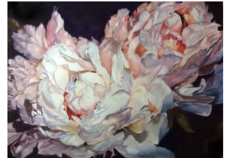
Joneile Emery, Springfield Peonies , 28 x 36, $2400