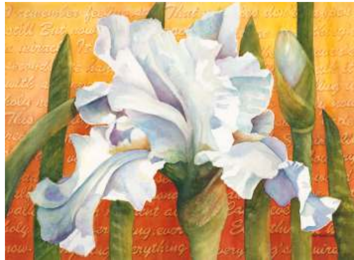
Charlotte Peterson, Central Point Everything's a Miracle, 30 x 38, $1500