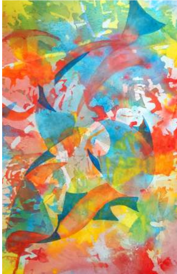
Tupper Malone, Beaverton Freedom One , 27 x 20, $270