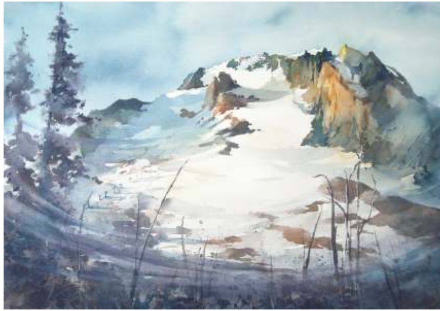
Beth Verheyden, Boring, Majesty , 28 x 39, $1200