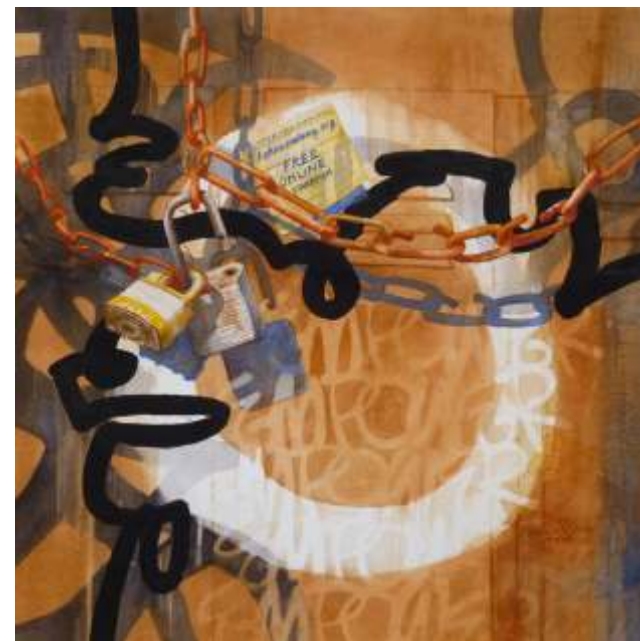
Linda Rothchild Ollis, Scappoose Unlock Your Potential 4 , 28 x 28, $1200