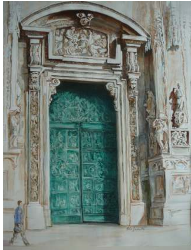
Hebe Greizerstein, Portland, Milano , 36 x 28, $1100