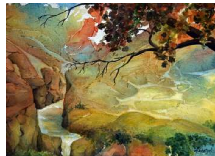
Linda Schatzel, Portland Canyon 17 x 21, $475