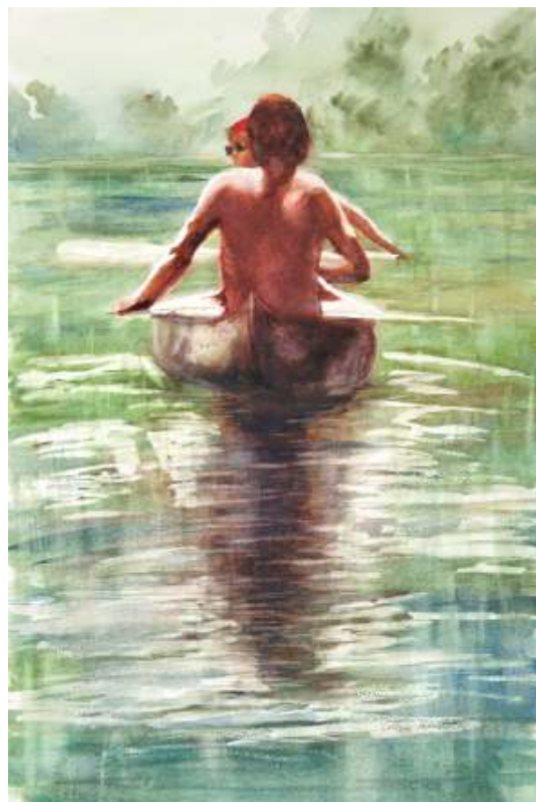
Colleen J Helmstetter, Gresham Going with the Flow , 24 x 20, $500