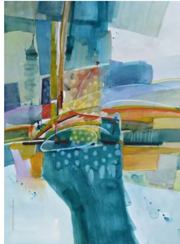
Lynda Hoffman-Snodgrass, Phoenix Sunday Afternoon , 38 x 30, $1800