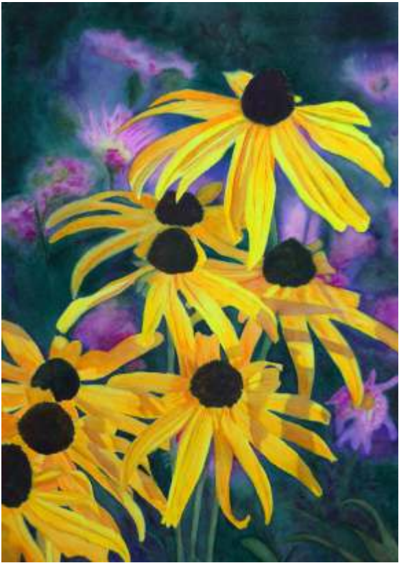
Carol Putnam, Tigard Dark Eyes , 27 x 21, $600