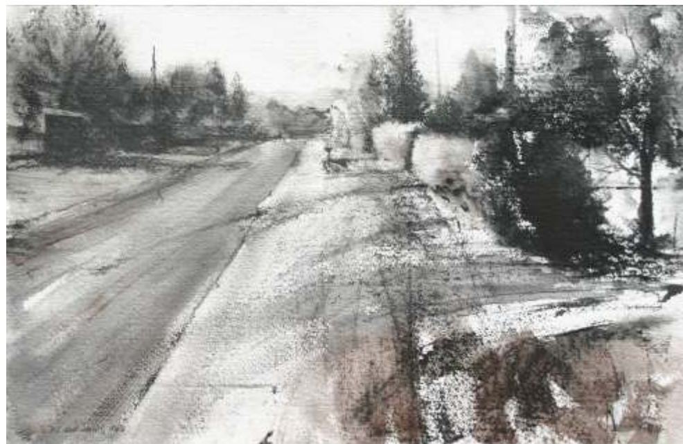
Lane Hall, Medford Road to the Past 3 , 21 x 29, $1000