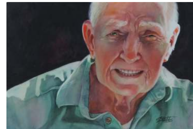
Chris Stubbs, Carlton Chronicles of Dementia: Confused Today , 22 x 29, $900