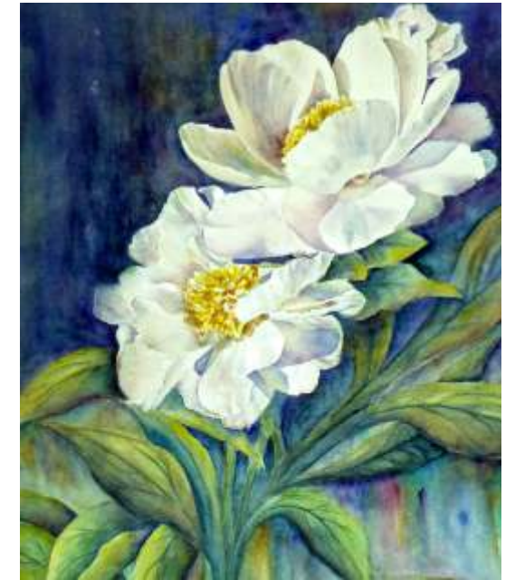
Diana Poorman, Tigard Spring Glows, 20 x 16, $435