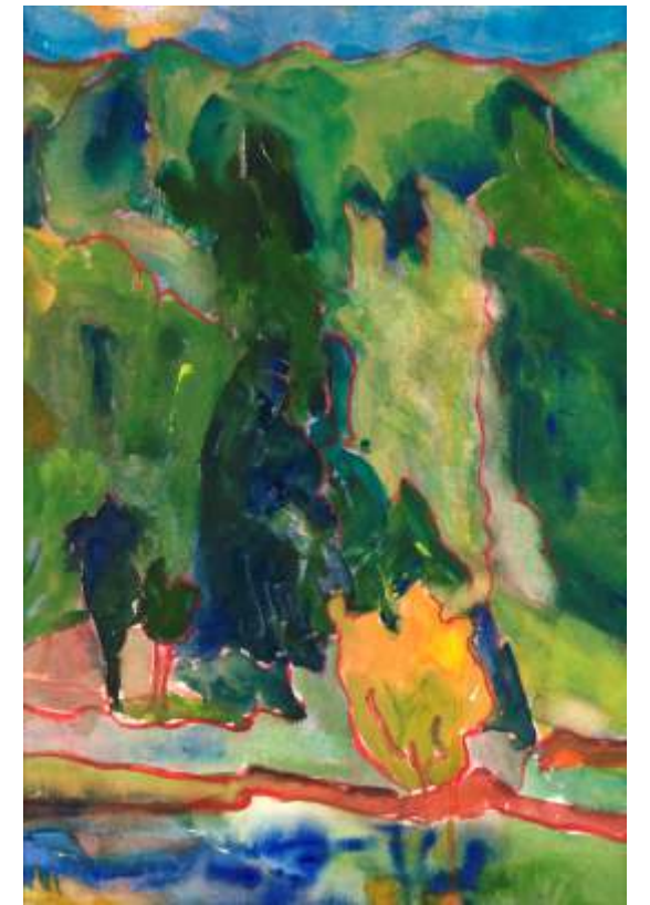
Amanda James, Lake Oswego The Yellow Bush , 26 x 20, $750