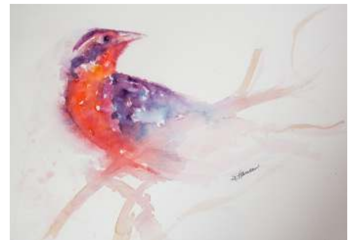
Sharon Hansen, Portland Contemplating Flight , 16 x 20, $450