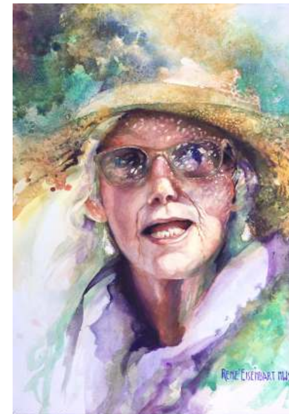
René Eisenbart, Portland Under the Tuscan Sun , 33 x 26, $1600