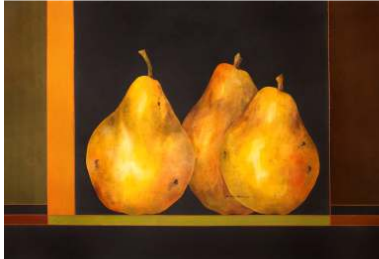
Bill Baily, Lake Oswego Pear Trio , 28 x 36 $1500