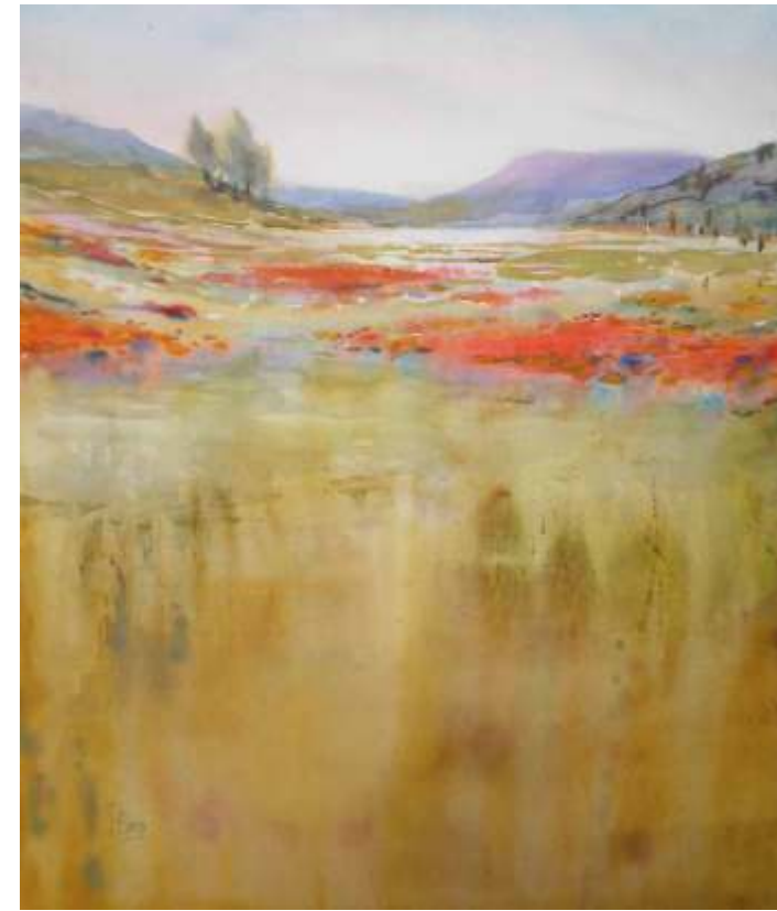
Robin Berry, Oregon City Broad Range , 24 x 21, $350