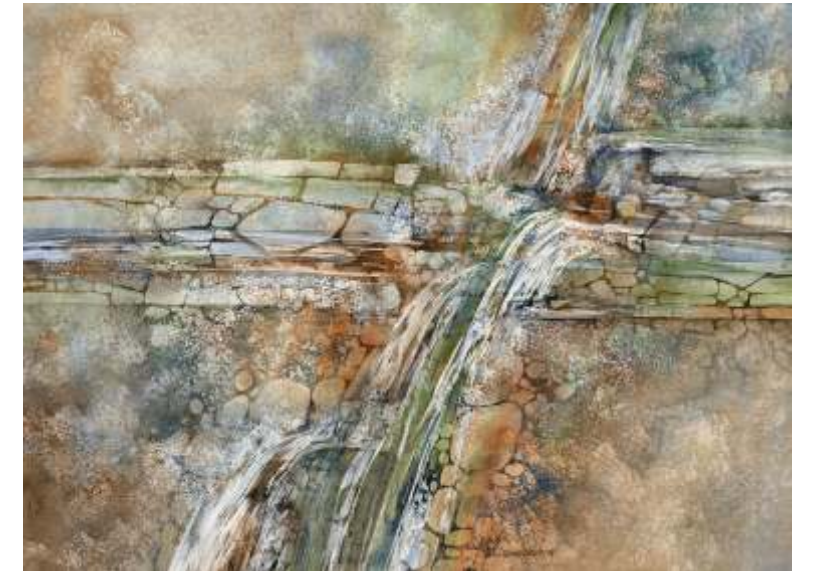
Linda Boutacoff, Medford Earth Awakening , 29 x 37, $1250