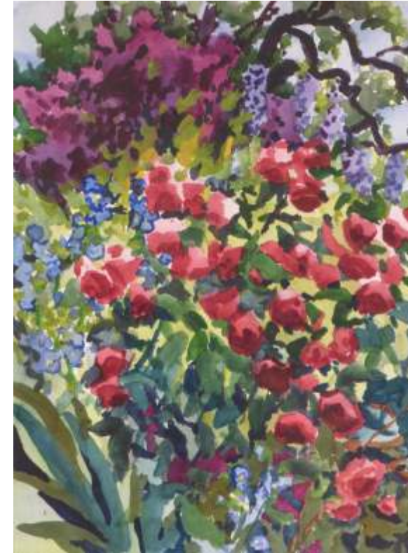
Sue Bennett, Jacksonville Garden Patterns , 22 x 19, $460