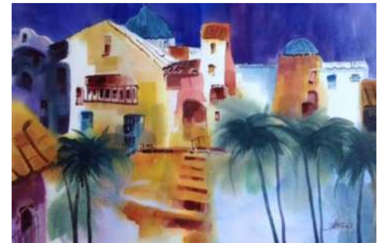
Javier Montoya, King City Desert Nights , 20 x 27, $500