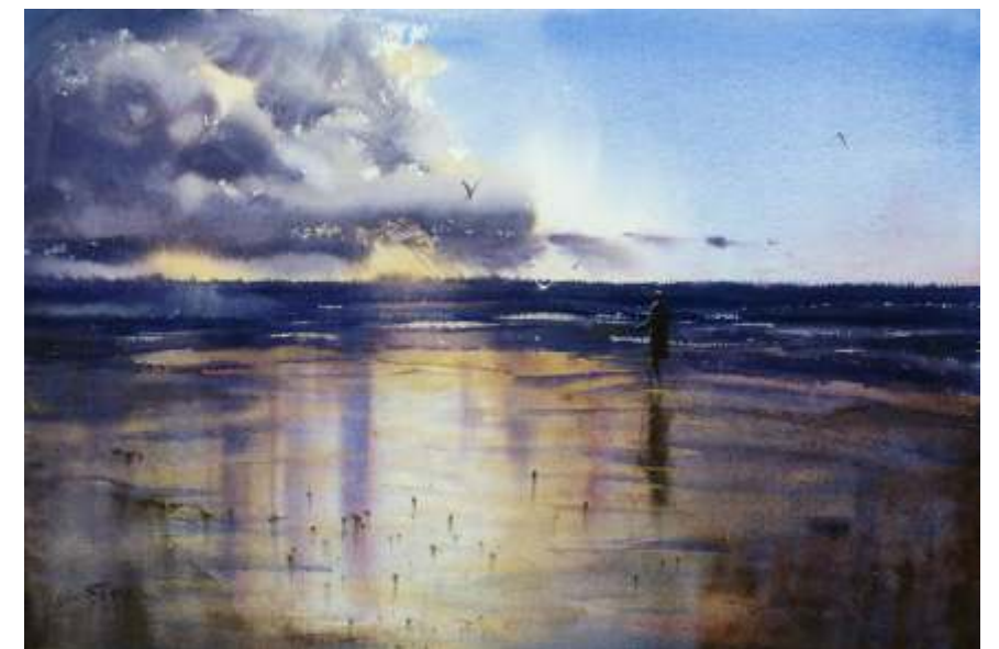
Sandra Pearce, Banks Chance of Rain , 21 x 28, $850