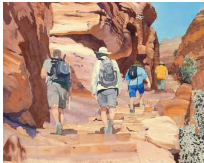
Mary Elle, Oregon City 800 Steps , 26 x 30, $1,200