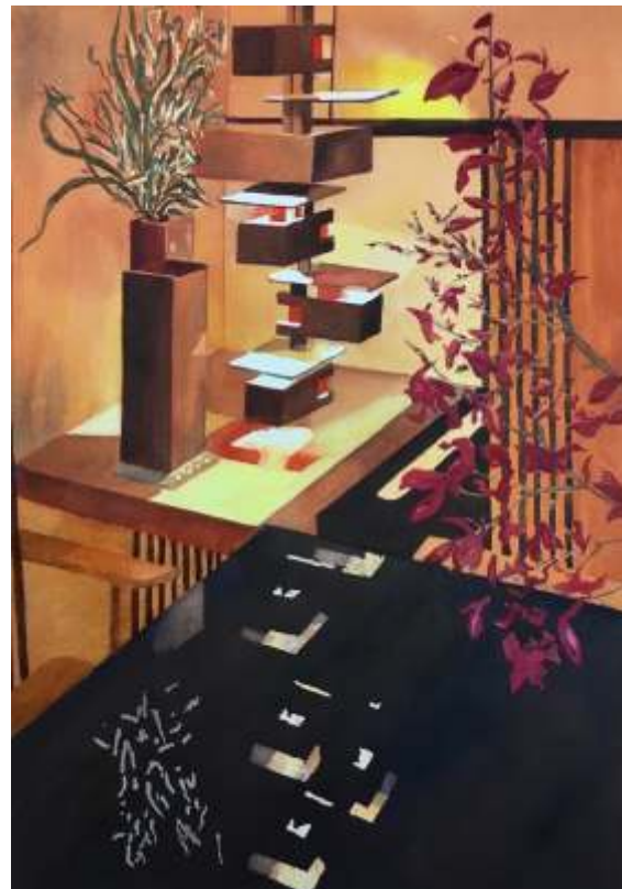
Carel DeWinkel, Salem Quiet Corner in Taliesin , 26 x 20, $350