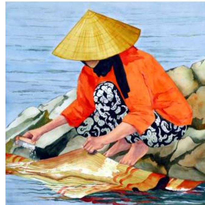
Margaret Godfrey, Blue River Women's Work , 28 x 29, $1,000