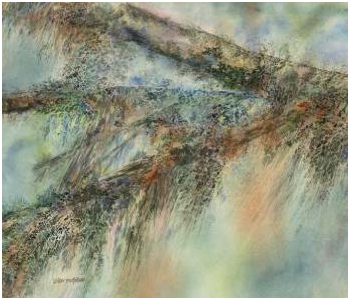
Linda Boutacoff, Medford Ancient Journey , 27 x 30, $1,200