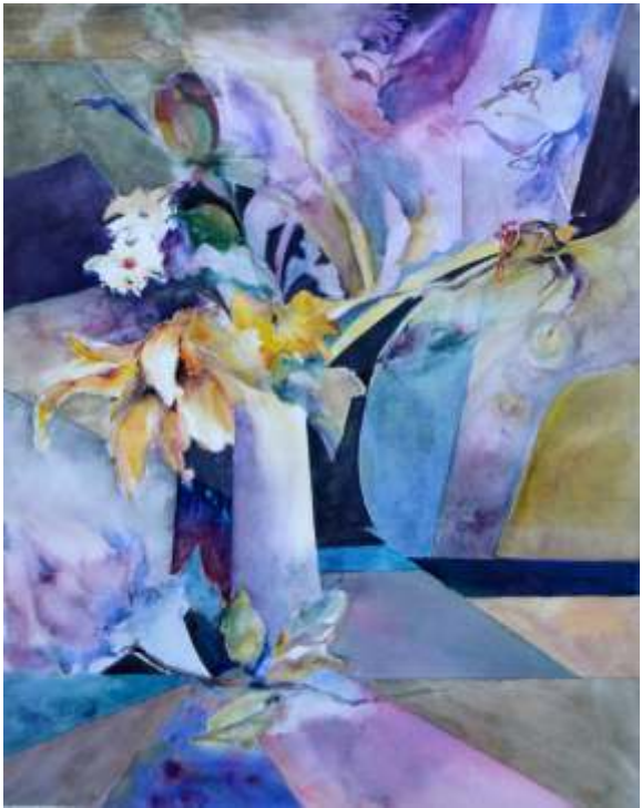
Jennie Chen, Portland Flower Variation , 24 x 20, $350