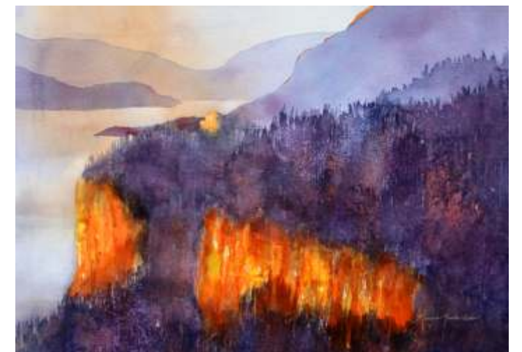
Laurie Martin-Cohn, Fairview Crown Point , 30 x 40, $400