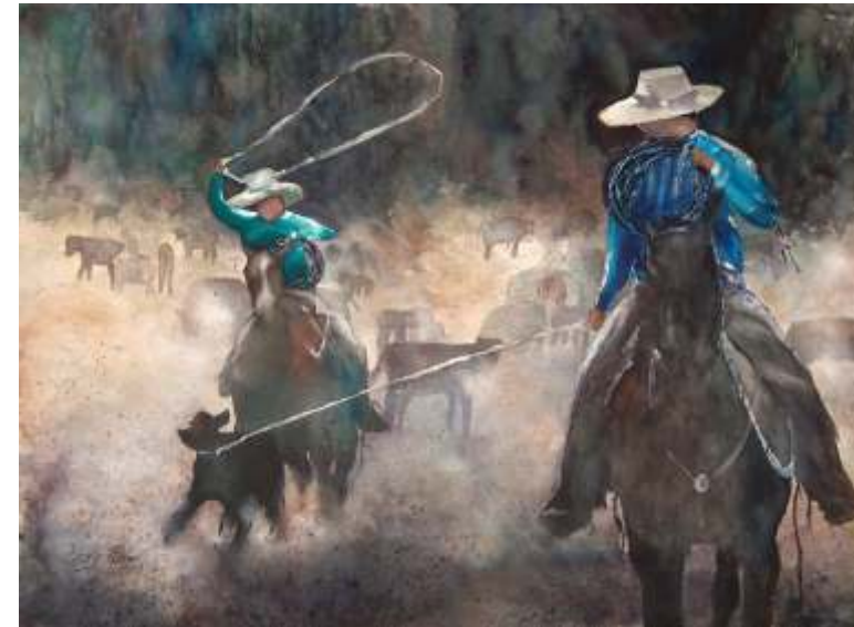
Cindy Pitts, Gresham Round Em Up , 28 x 36, $900