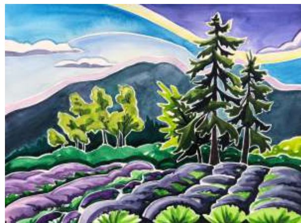
Dona White, Portland If a Tree Falls , 20 x 17, $500