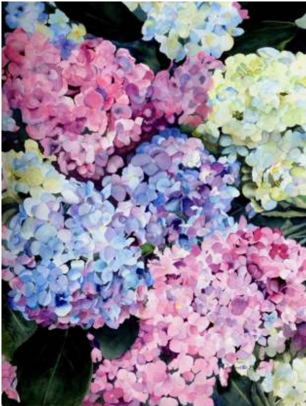
Jeannette Baker, Eugene Full Bloom , 37 x 29, $2,500