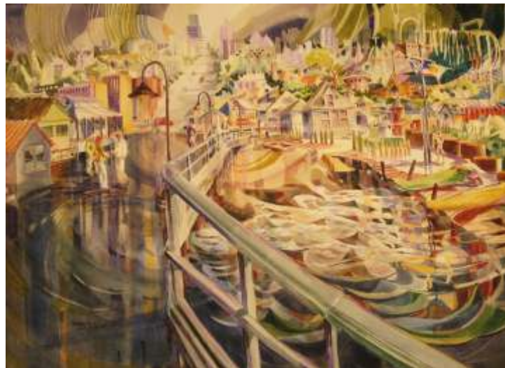
Leslie Cheney-Parr, Sandy Hyde Street Pier Morning , 28 x 36, $1,600