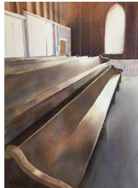
Debbie Loyd, Milwaukie Nostalgia , 20 x 16, $750