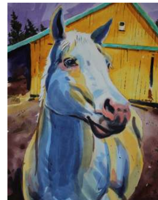
Vernon Groff, Sandy Neighborhood Watch , 24 xX 21, $1,440