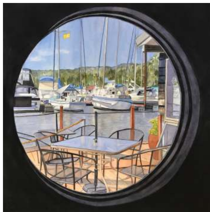
Kris Preslan, Lake Oswego In Port , 30 x 30, $1,500