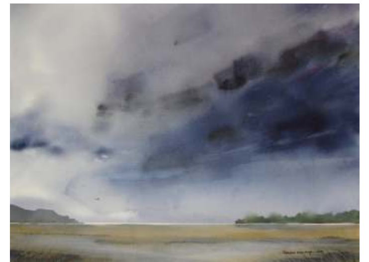
Harold Walkup, Beaverto Marsh Line , 24 x 30, $1,100