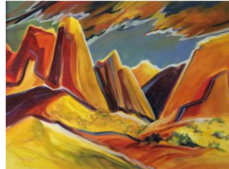
Sally Bills Bailey, Mt Hood, , Storm Coming , 29 x 36, $1,500