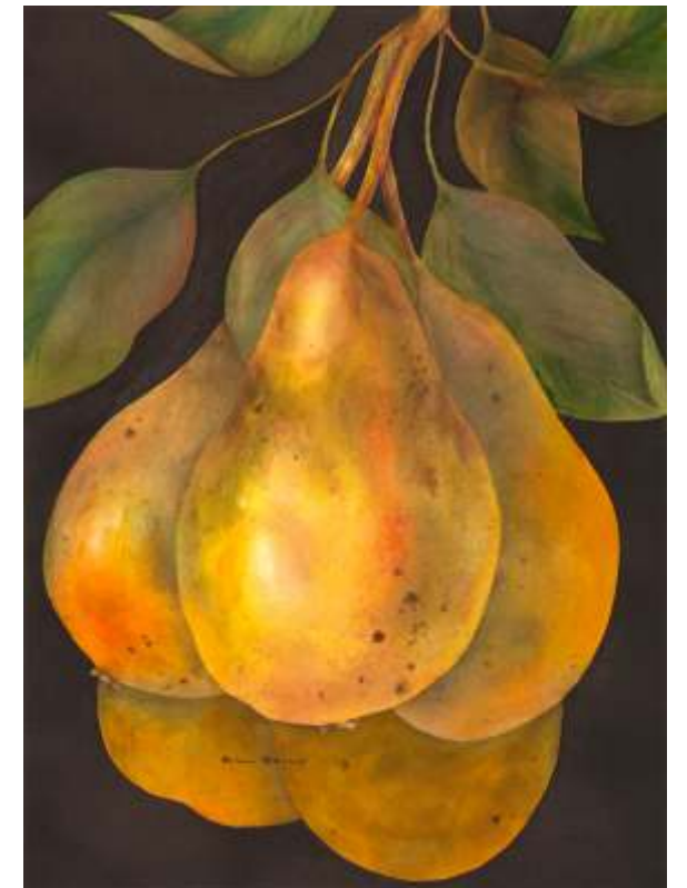
Bill Baily, Lake Oswego Golden Glow , 28 x 22, $750