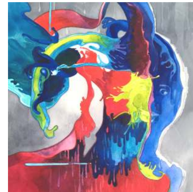
Linda Rothchild Ollis, Hillsboro Create with Courage , 28 x 28, $900