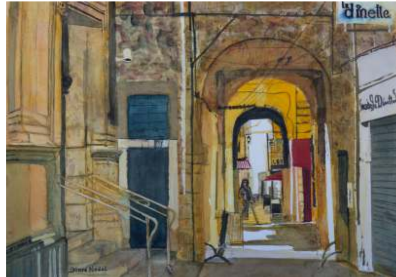
Diana Nadal, Portland Avignon Inner City , 23 x 29, $950