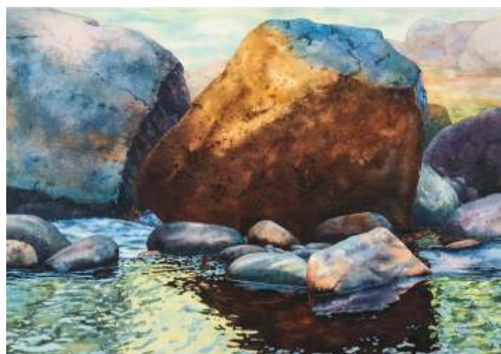
Mary Rollins, The Dalles Morning Mist , 28 x 35, $1,000