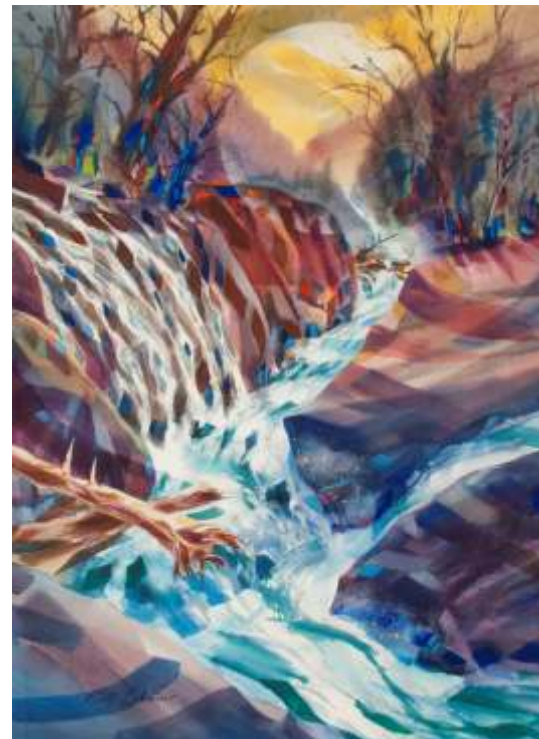
Ed Labadie, Hillsboro Convergence , 36 x 28, $1,675