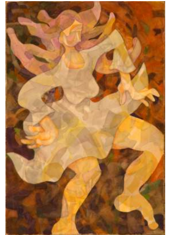
Kara Pilcher, Silverton Hop-Hip , 32 x 24, $650