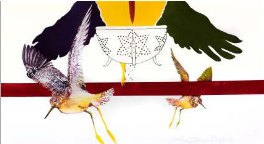
Kathryn Damon-Dawson Westlake Strained Relationships 23 x 37, $1,000