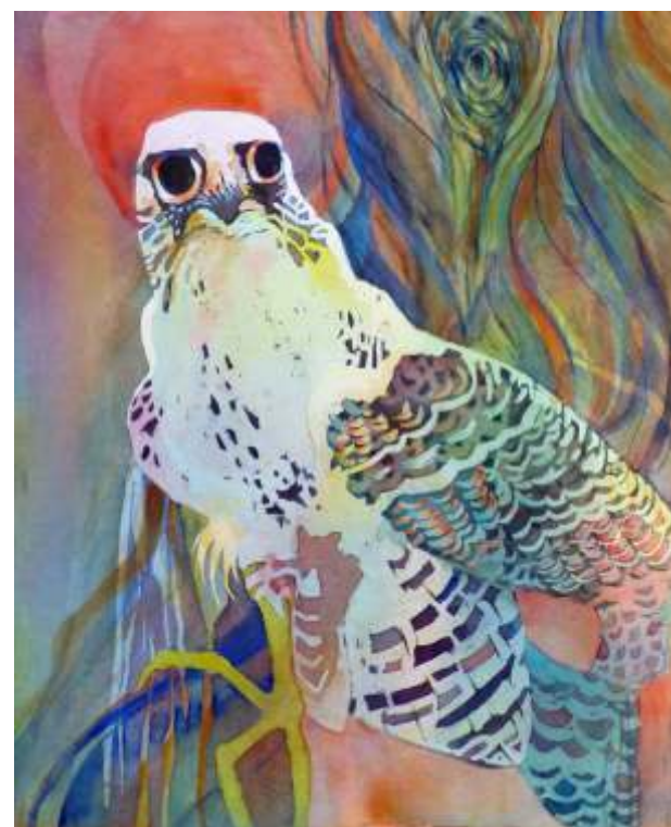
Hazel O'Rear Reeves, Bend Knot in The Woods , 26 x 22, $800