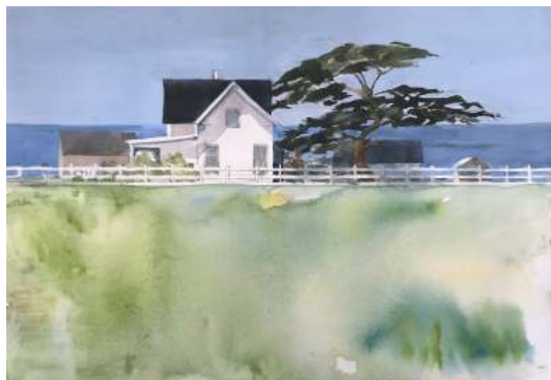
Dorothy Eshleman, Amity At Home in Bandon , 21 x 27, $650