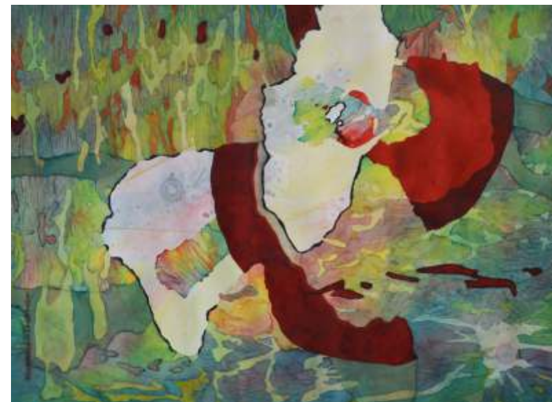
Lynda Hoffman-Snodgrass, Phoenix Tropical Dream , 30 x 38, $1,800