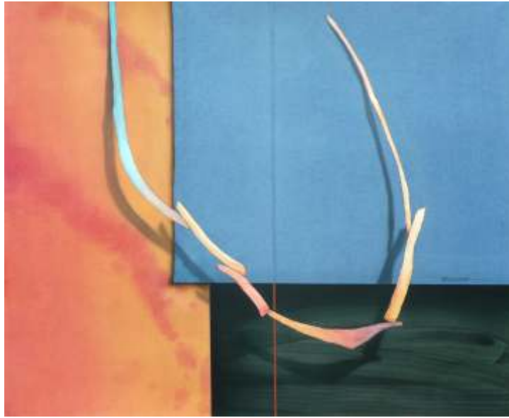
Geoffrey McCormack, Eugene Learning to Walk in My Own Shadow #9 30 x 36, $3,500