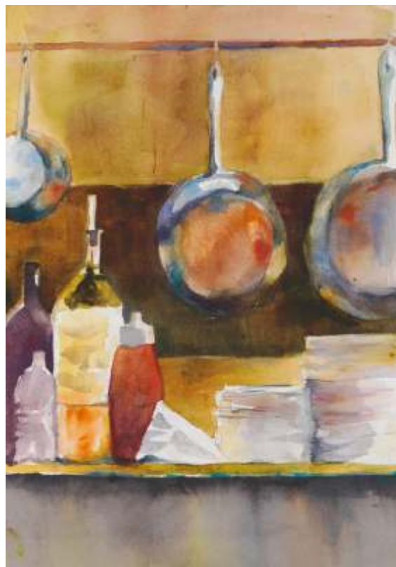
Leslie Dugas, Beaverton Pots and Pans , 20 x 16, $400