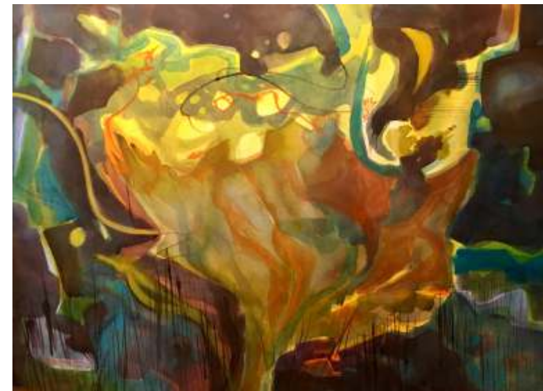
Ruth Armitage, Oregon City Wild Daffodil , 30 x 38, $1,950