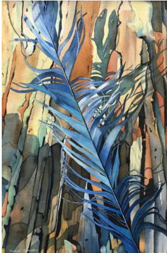
Patrice Cameron, Portland Blue on Bark , 24 x 28, $800