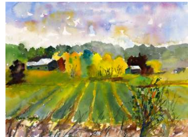
Ron Spears, Lake Oswego Autumn in Wine Country , 16 x 20, $350