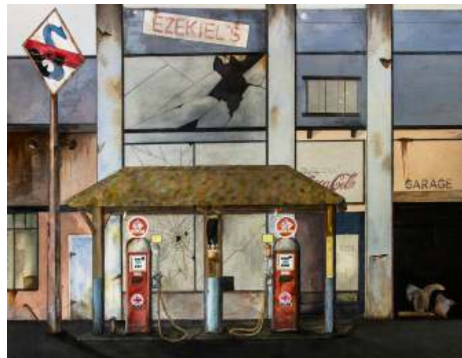
Bonnie Holubetz, Lincoln City Ezekiel's , 30 x 38, $1,800