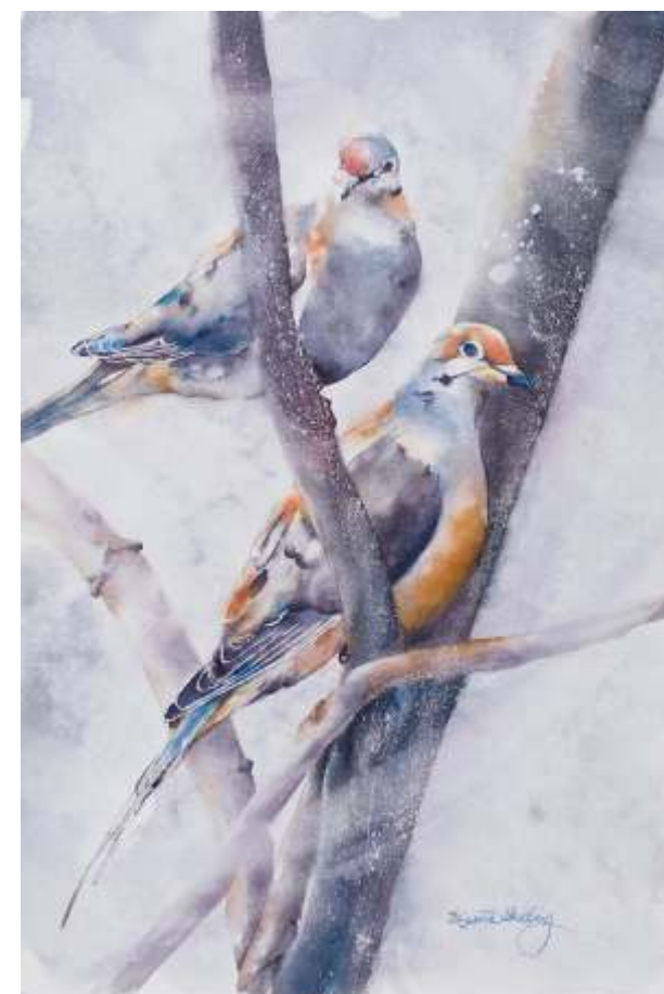
Elizabeth Schilling, Gresham Morning Song , 27 x 19, $530