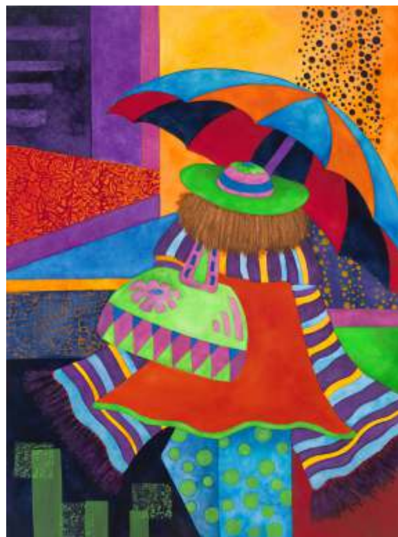
Sandra Wood, Portland Flagrant Lady , 38 x 30, $1,100