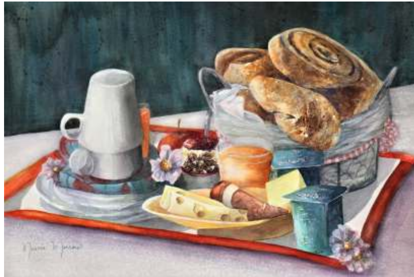
Marcia Morrow, Sandy French Breakfast , 20 x 28, $800