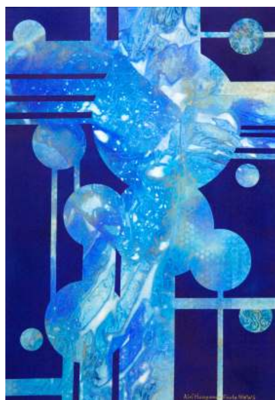
Airi Foote, Lake Oswego Off the Beaten Path , 25 x 20, $800