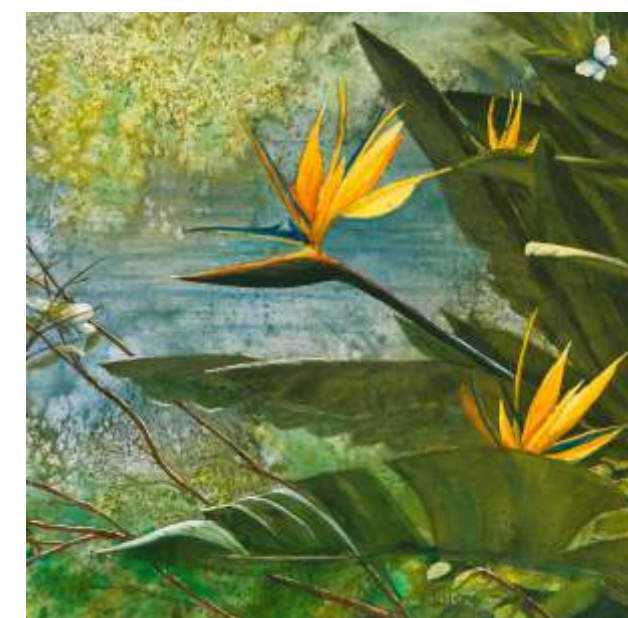
Allison Ruiz, Aloha Taking Flight , 20 x 20, $475