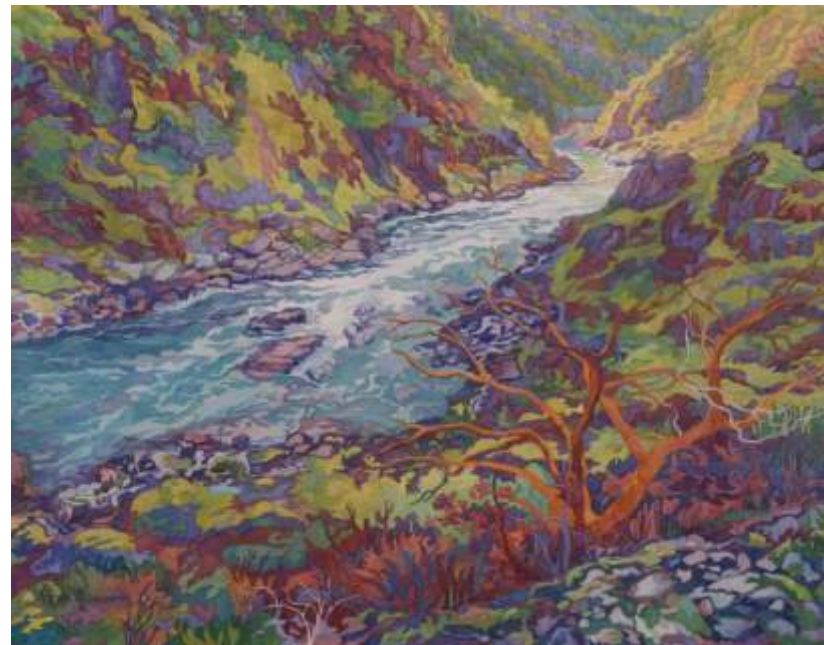
Sarah Bouwsma, Portland Rainie Falls Hike , 25 x 30, $1,200