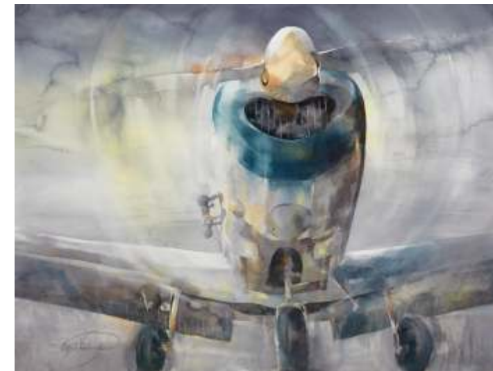
Beth Verheyden, Boring 1946 , 29 x 37, $2,500