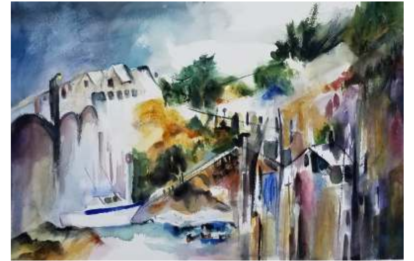
Marion Moir, Newport Depoe Bay , 21 x 28, $1,000