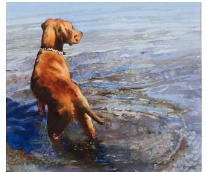
Yvonne Knoll, Sandy Anticipation , 20 x 22, $800