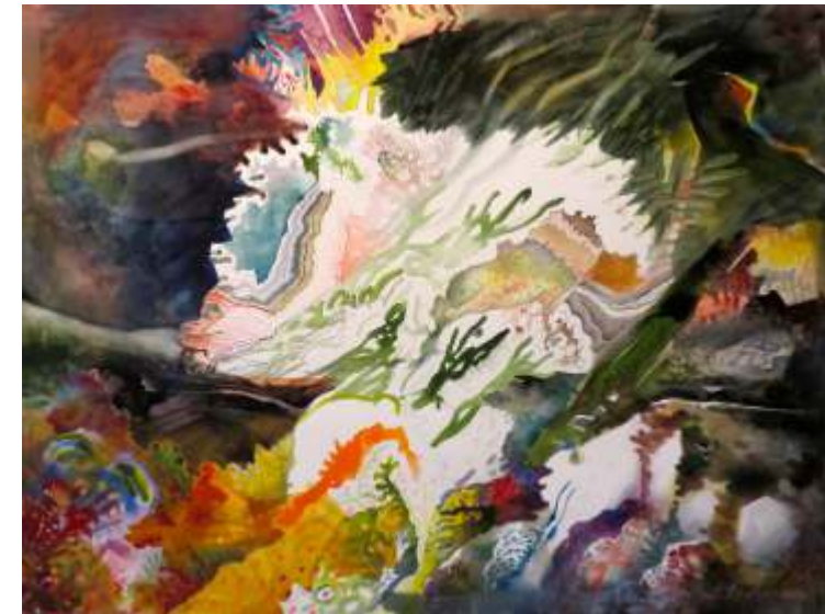
Victoria Tierney, Bandon May The Force Be With You , 28 x 36, $1,200