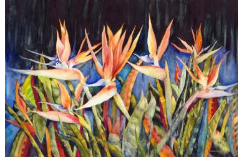
Charlotte Peterson, Central Point A Flock in Paradise , 28 x 38, $1,400