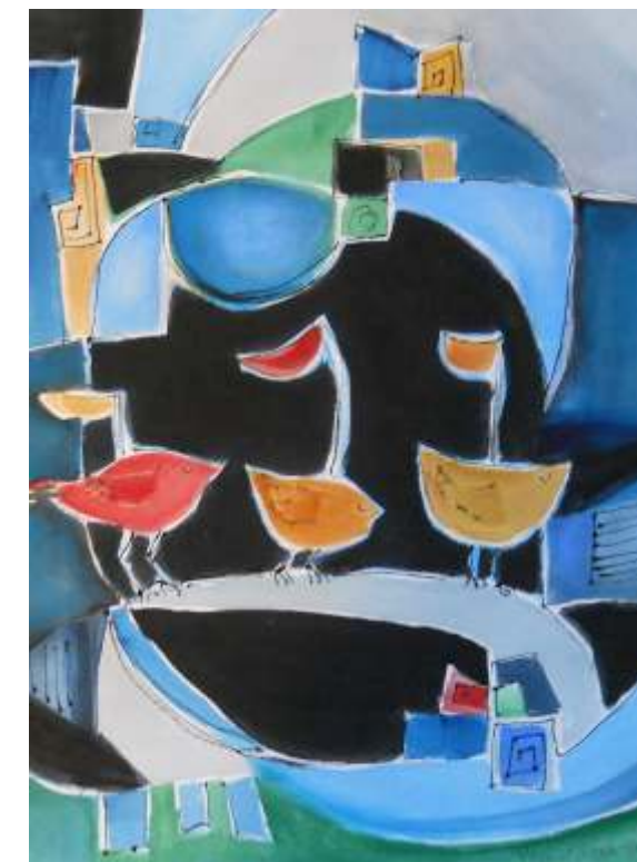
Phyllis Meyer, Beaverton Moonlight Parade , 28 x 22, $500