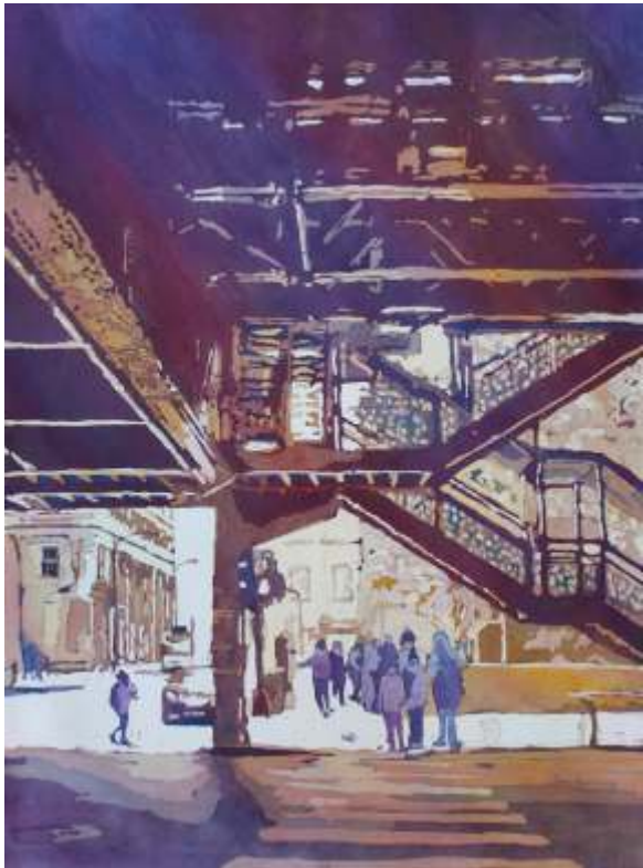
Jenny Armitage, Salem Under The El , 28 x 26, $1,000