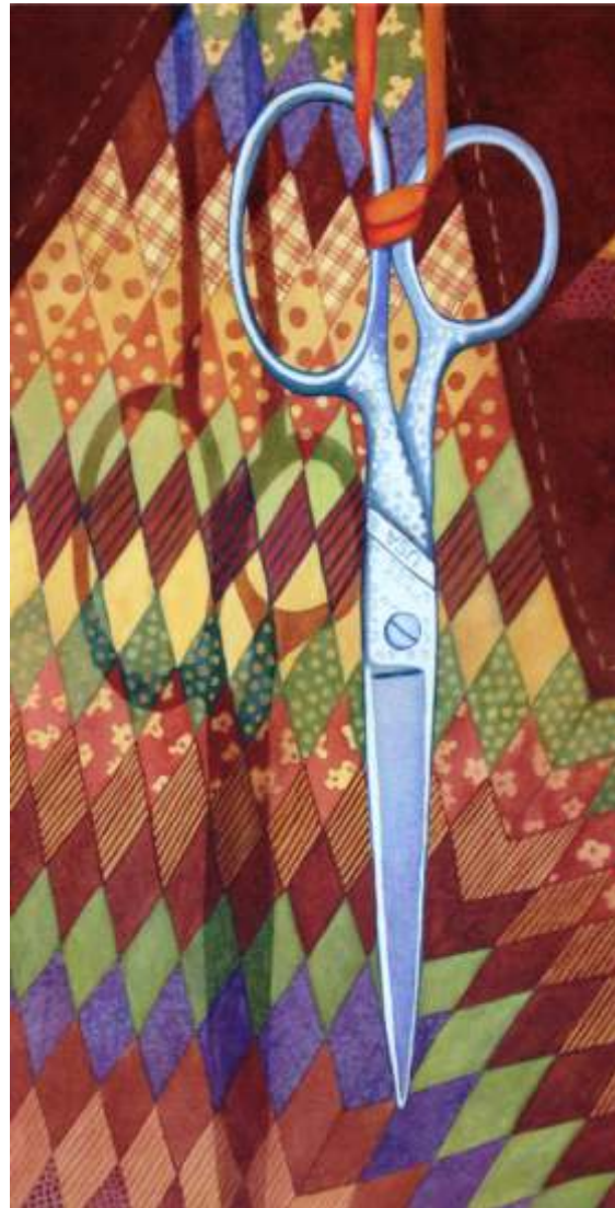
LaVonne Tarbox-Crone, Eugene Scissors with Quilt , 37 x 22, $1,200