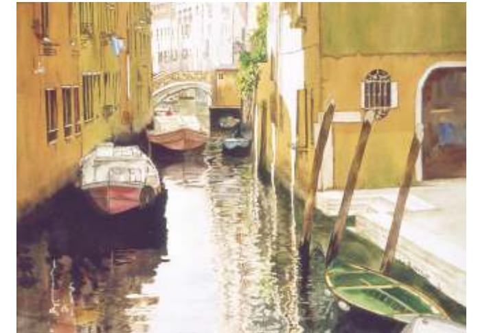
Kris Preslan , Lake Oswego "Una Viuzza Tranquilla", Venice, Italy , 16 x 21, $450