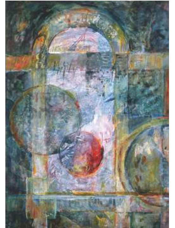
Sunny Smith , Portland Universal Harmony , 29 x 22, $900