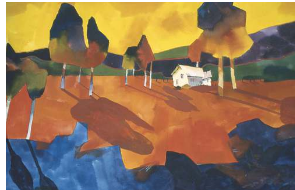
Harold Walkup , Beaverton Time For a Story , 22 x 30, $950