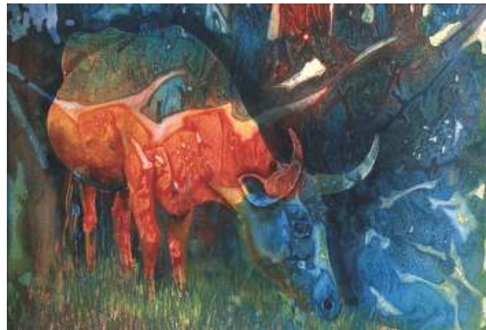
Nan Tupper Malone , Portland Technicolor Cows VIII , 15 x 21, $550