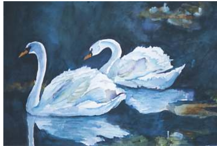
Lois Marchington , Portland Mates , 14 x 21, $400