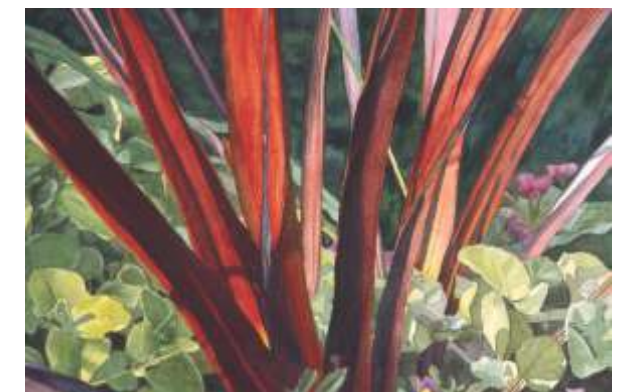
Carol Putnam , Tigard Rainbow and Limelight , 9 x 13, $500