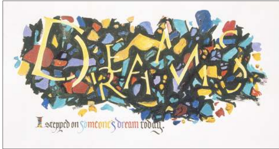
Jo Oekerman Beaverton Dreams , 10 x 19 $400