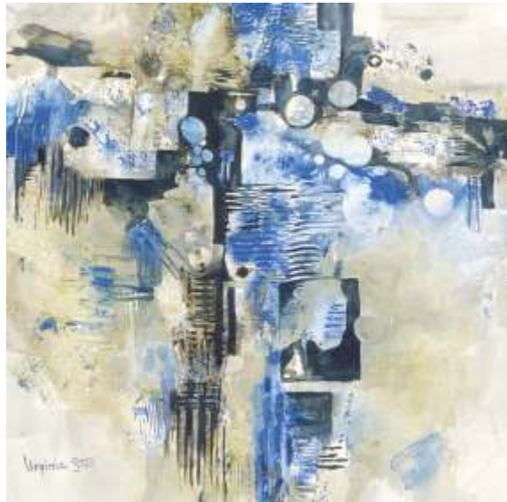
Virginia Stull , Tigard Feeling the Bliss 20 x 20, $800