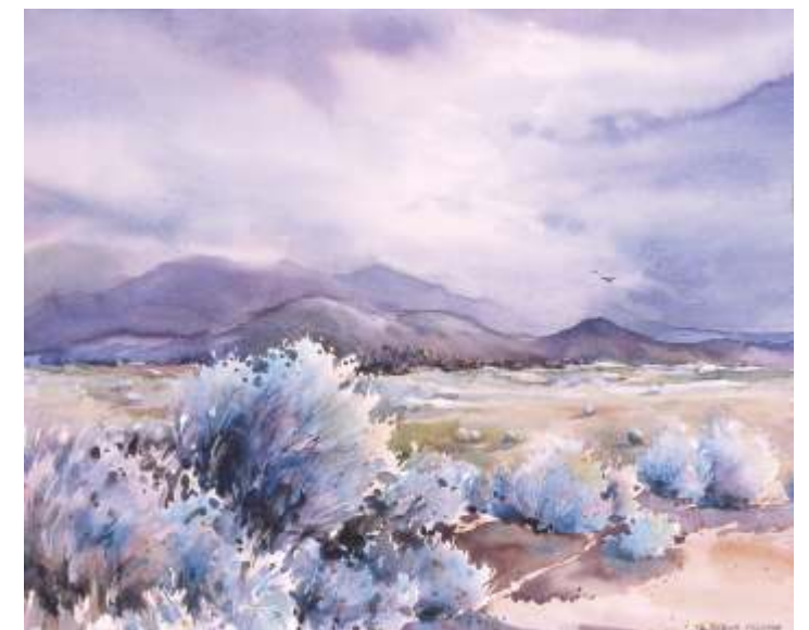
Hyon Fielding , Fossil Crows , 20 x 24, $800