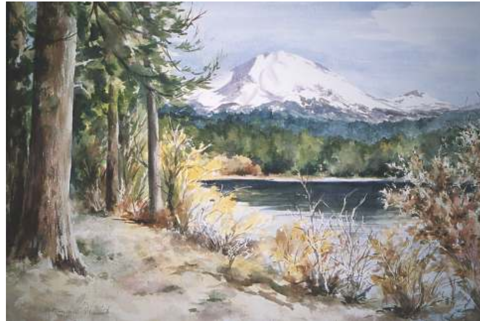
Marilyn Hurst , Medford Mt. Lassen at Manzanita Lake , 20 x 29, $950