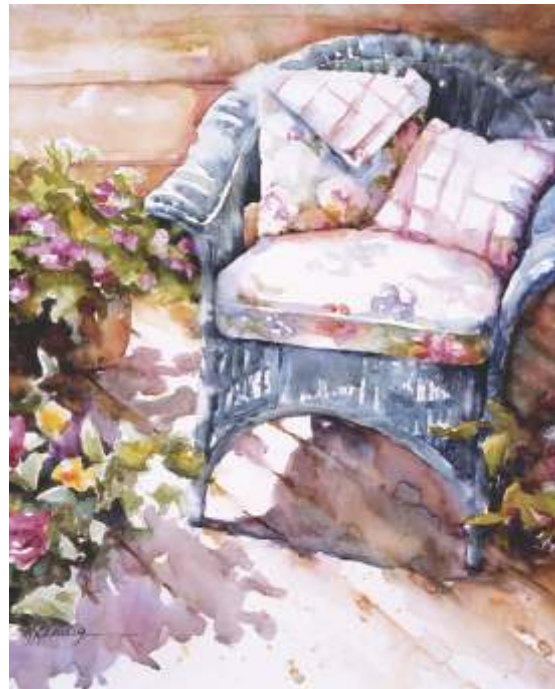
Kati Bendig , Milwaukie Quiet Retreat , 14 x 12, NFS