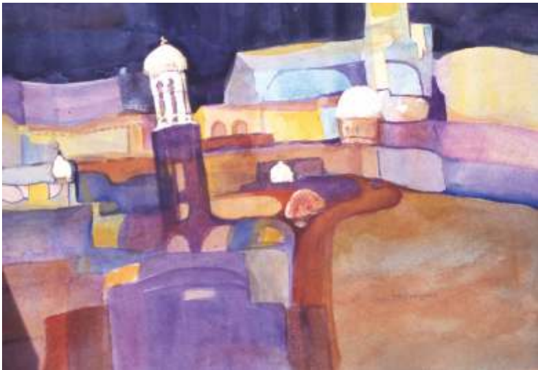
Wynn Pedersen , Jacksonville Along the Silk Road: A Land Askew , 11 x 14, $700