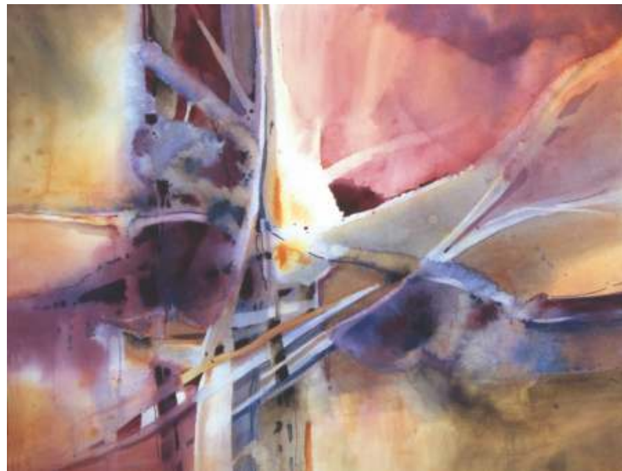
Irene Young , Florence Emersion #1 , 18 x 25,