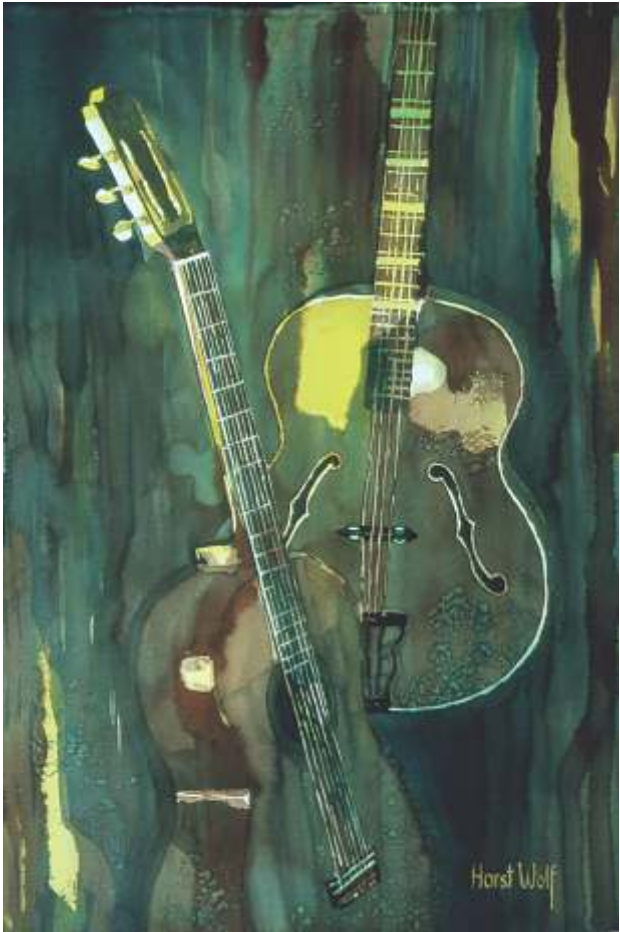
Horst Wolf , Brookings Two Guitars , 15 x 22, $700