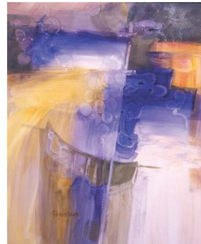
Susan Greenbaum , Lake Oswego Boundaries , 23 x 19, $650