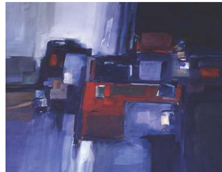
Dolores Ribal , Central Point Back Alley , 20 x 25, $1200