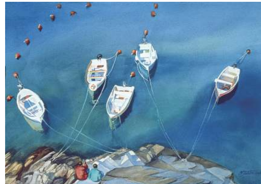
Chris Stubbs , Tualatin Floats 'n' Boats in Rio Maggiore 21 x 29, $1200