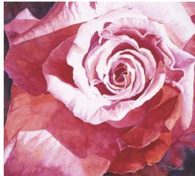
Jean Blatner , Portland Early Morning Rose , 20 x 21, $1200