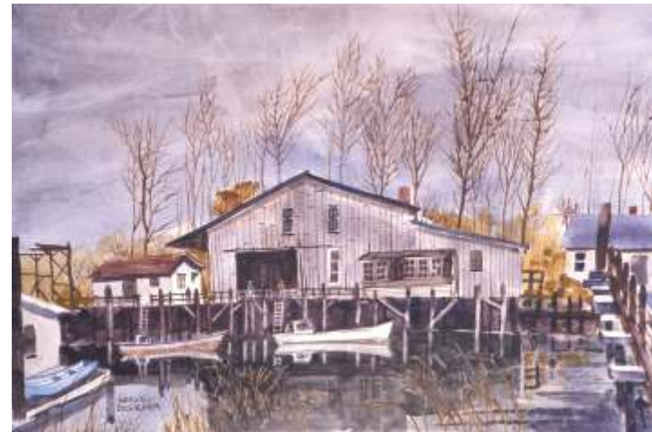
Garve Beckham , Tigard Somber November , 15 x 22, $500