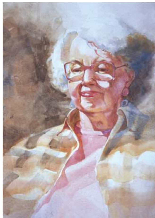
Lynn Powers , Albany A Portrait of Jane , 18 x 14, $700