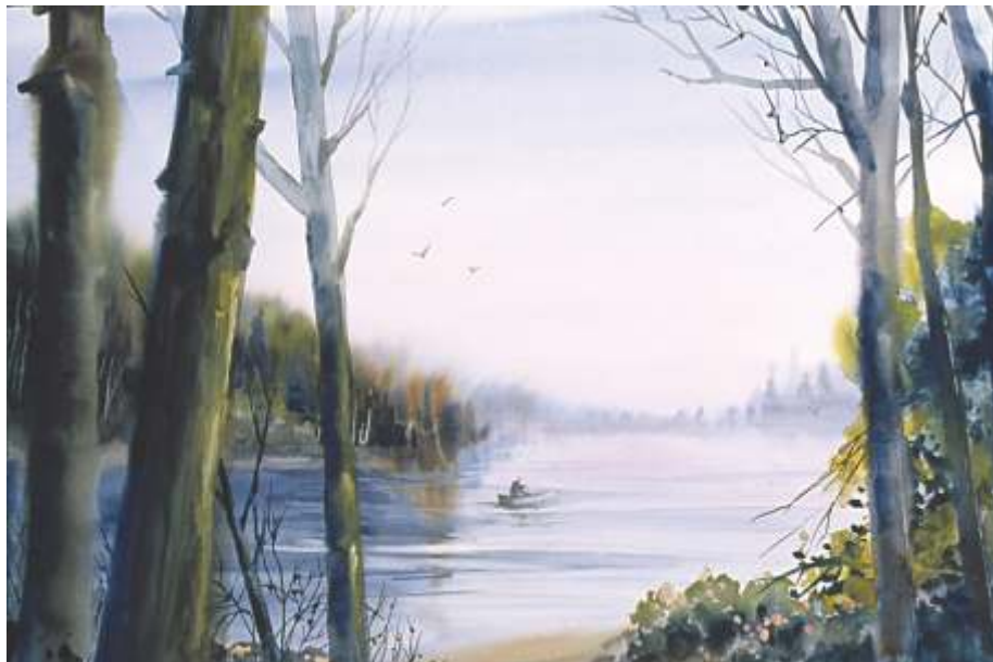
Julie Shirley , Portland Solitude , 21 x 29, $800