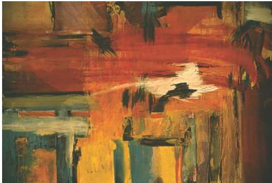
Bruce Ulrich , Beaverton Red Alar , 22 x 30, $1100