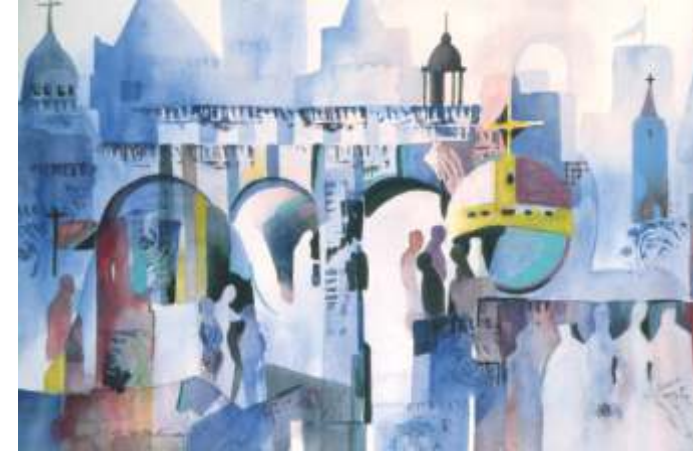
Britt McNamee Portland Europa I , 14 x 21 $300