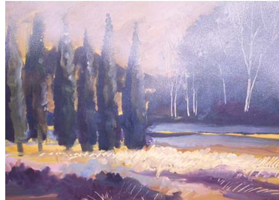
Dee Frank , Gladstone Wood River Valley, Idaho 20 x 29, $950