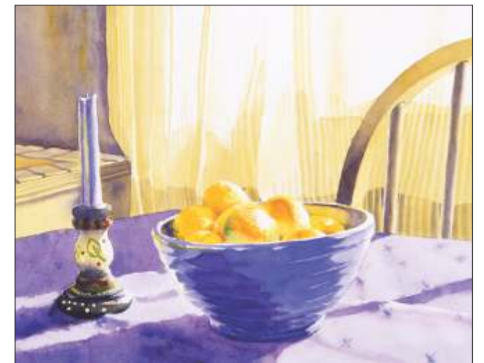
Nancy L. Muren , Keizer Light on a Winter Day , 14 x 18, $350