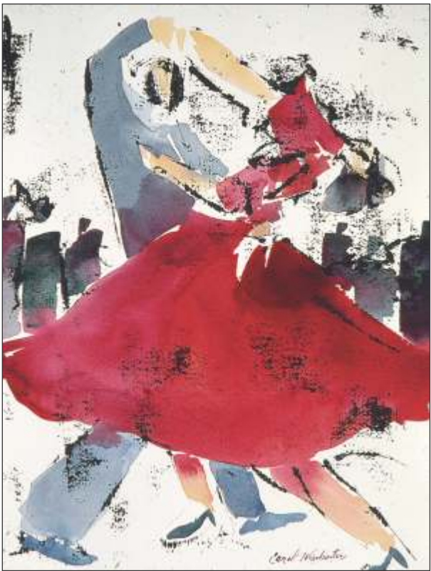
Carol Winchester , Portland Swingin' Around , 14 x 11, $600