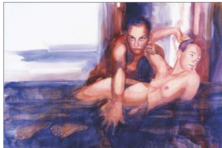
Dana Hansler , Eugene Still Waters , 15 x 22, $750