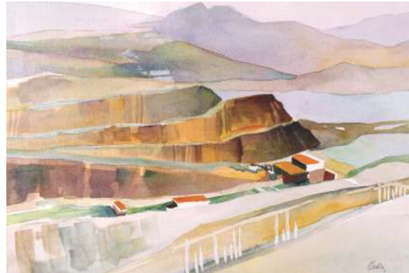
Shirley Oakley , Dallas Locks at Three Gorges/China #1 , 14 x 20, $500