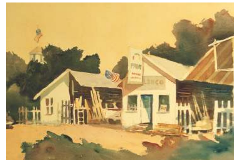
Olin Jones , Medford Jacksonville Lumber , 14 x 20, $350