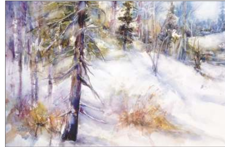
Iva Wakeman , Portland The Warmth of Winter 15 x 22, $500