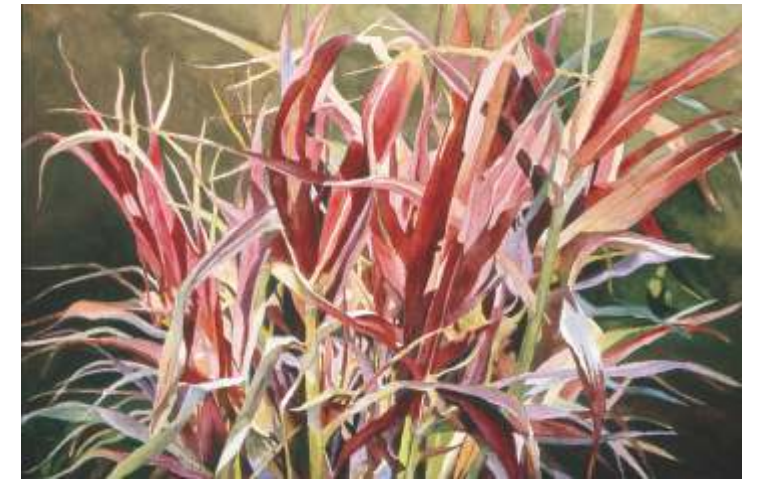
Barbara Vance , Lake Oswego Red Grass , 15 x 22, $400