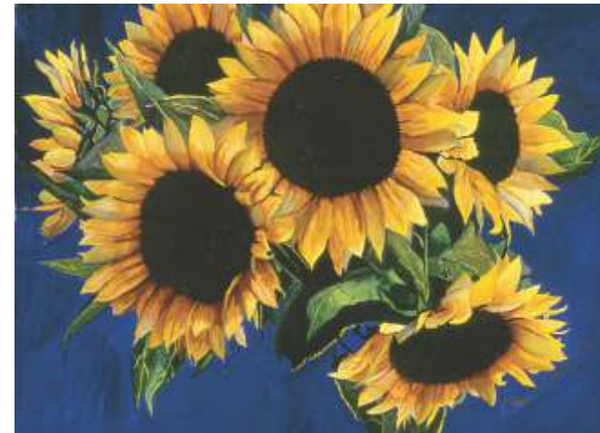
Pam Wallace , Gresham Sol Fleur , 16 x 22, $875