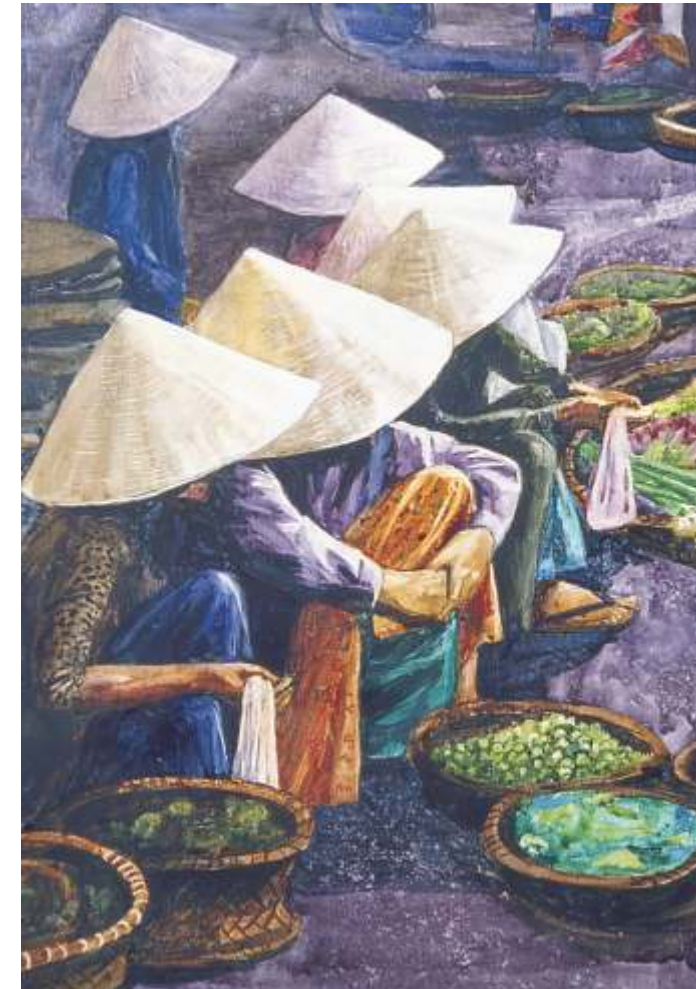
Carol Sands , Portland Asian Vendors , 30 x 25, $550