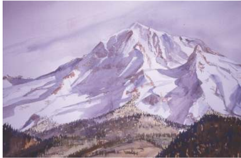
Steve Ludeman Rhododendron Fall Colors , 15 x 22 NFS