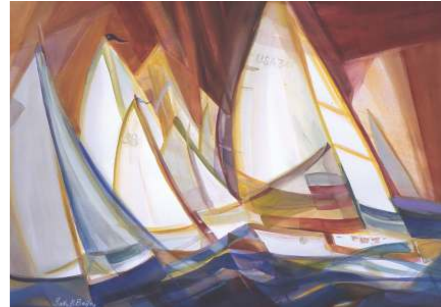
Sally B. Bailey , Mt. Hood Sail Shapes , 21 x 28, $1200