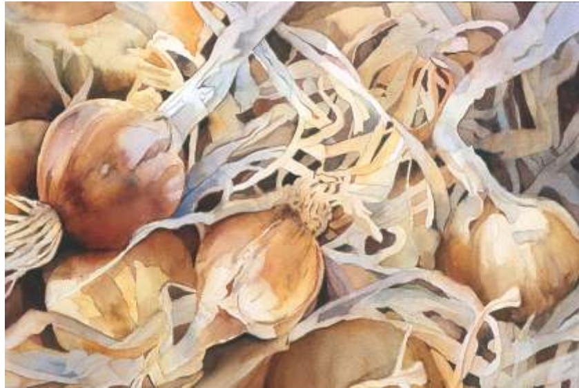
Sally Schwader , Eugene The Onion Harvest , 13 x 21, $595