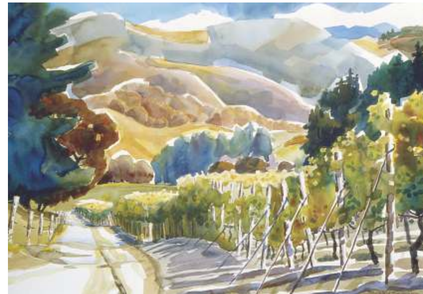
Susan Spears , Lake Oswego Ann Aimee Winery--Looking East , 22 x 30, $900