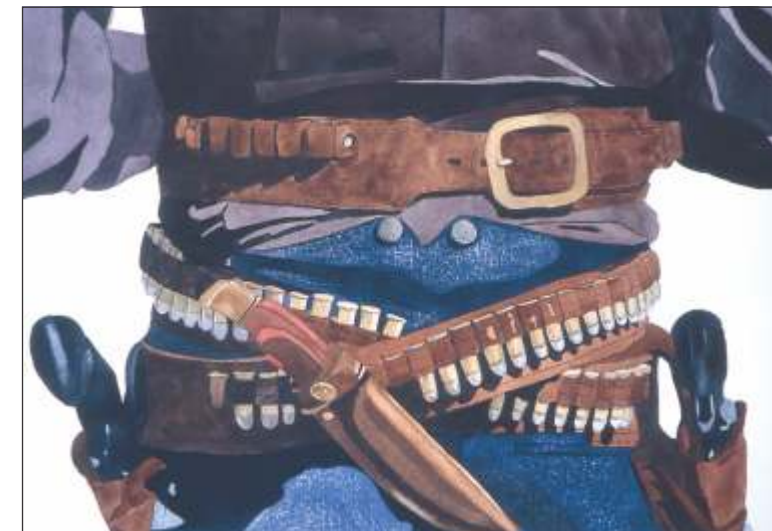
Charlene Brussat , Jacksonville Backup , 15 x 22, $1200