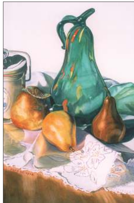
Dodie Setoda , Portland Pear Medley , 16 x 10, $700