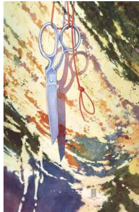
LaVonne Tarbox-Crone , Eugene Scissors with Orange , 26 x 17, $1100