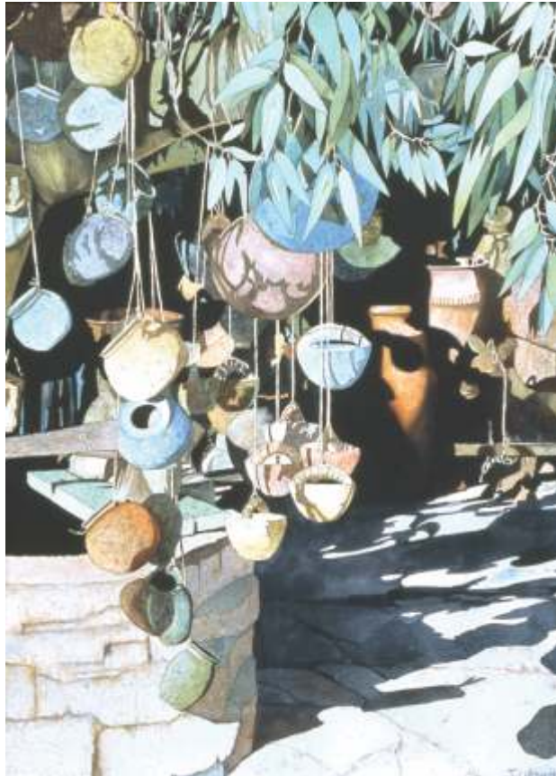
Jaqueline Lukowski , Eugene The Olla Tree , 30 x 22, $700