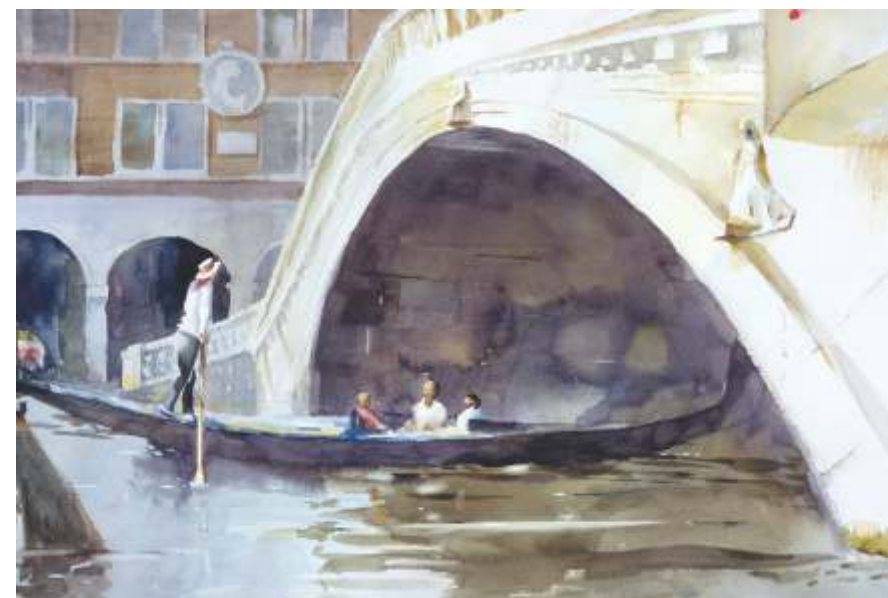
Sam Rouslin , Salem Grand Canal , 14 x 20, $900