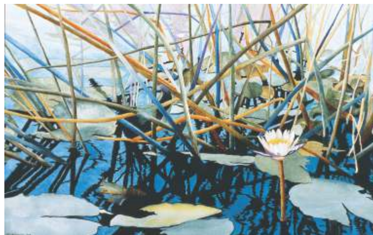
Stephen Ferris , Portland Botswana Beauty 14 x 23, $1100