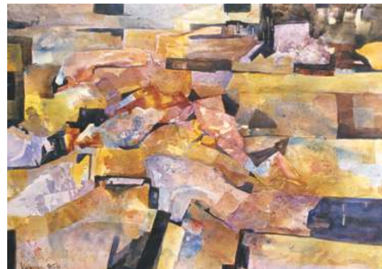
Virginia Stull , Tigard Kaleidoscope , 20 x 28, $850