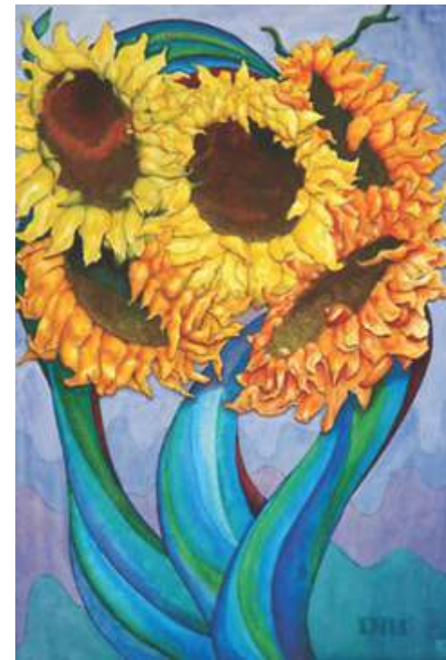
Dale Wells, Brookings Twisted Sunflowers , 21 x 15, $800