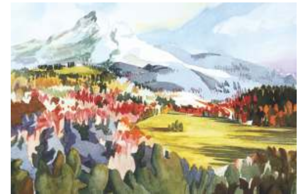
Leslie Cheney-Parr, Sandy Mt. Hood (Late Afternoon) , 10 x 14, $300