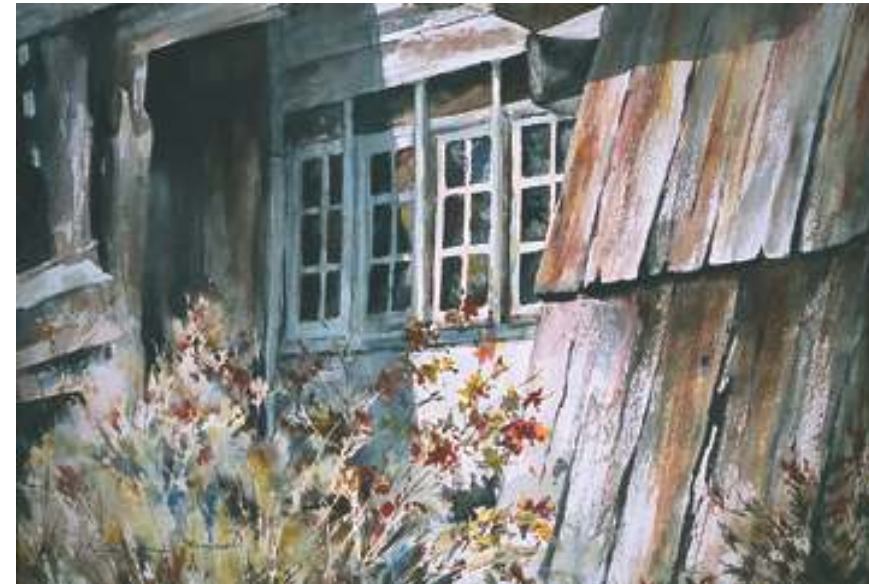
Marilyn Hurst, Medford Rustic Reflections , 14 x 19, $750