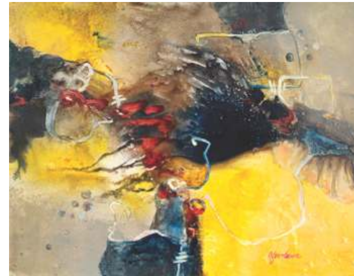
Susan Greenbaum, Lake Oswego Bonding , 19 x 25, $850