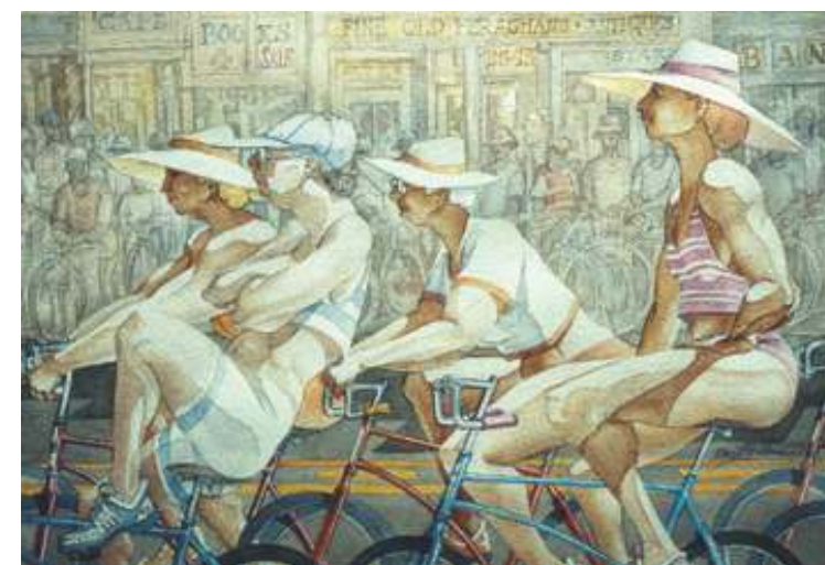
George Schoonover Yachats Feraghans , 15 x 22 $2,500