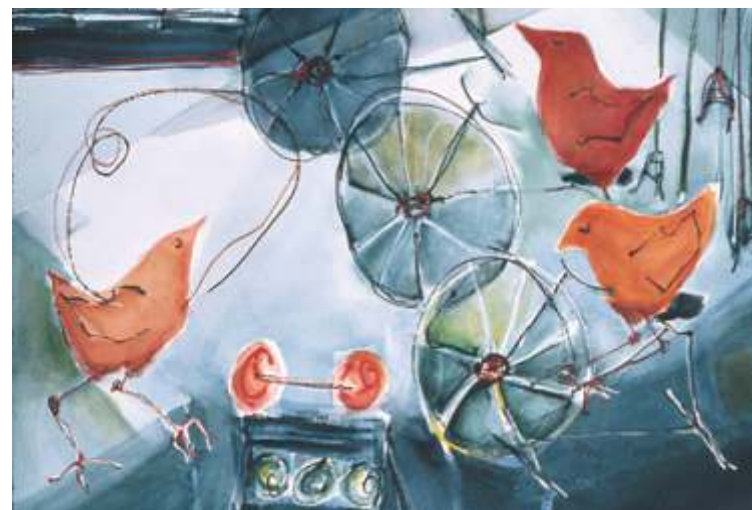
Phyllis Meyer Beaverton Gym Birds V 14 x 20, $400