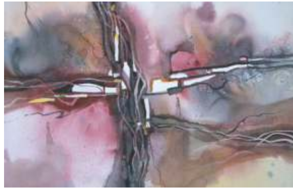
Irene Young , Florence Emersion 7 , 12 x 16, $500