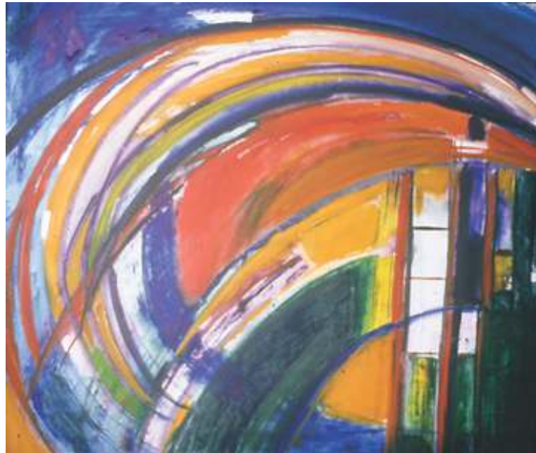
Janet Louvau Holt Portland Windows of Hope I 22 x 25, $900