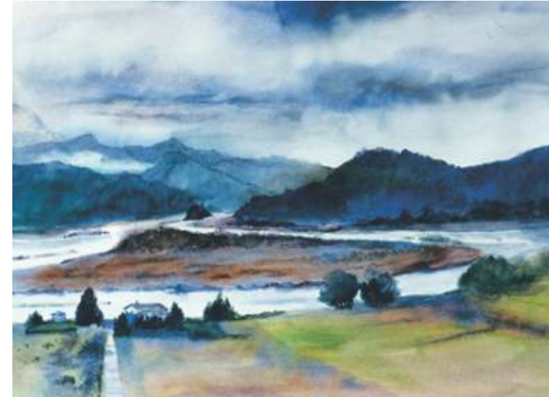
Pat Renner, Gold Beach Spring in the Valley , 22 x 30, $700