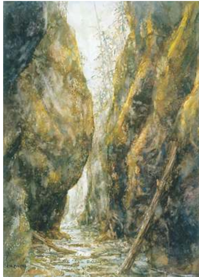
Kim Smith , Prineville Solitude , 35 x 25, $800