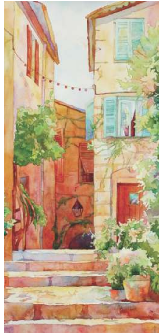
Cindy Briggs, Bend St. Paul Passageway 28 x 13, $1200