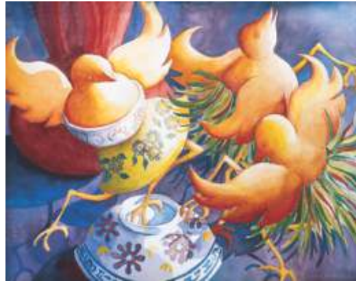
Kara Pilcher, Boring A Bird in the Bowl is Worth Two in the Grass 10 x 13, $450