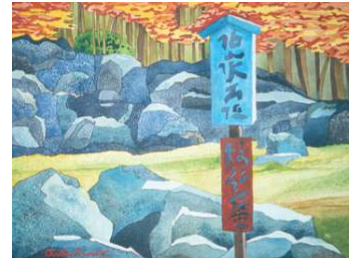
Charlene Brussat, Jacksonville Zen Rock Garden , 15 x 18, $900