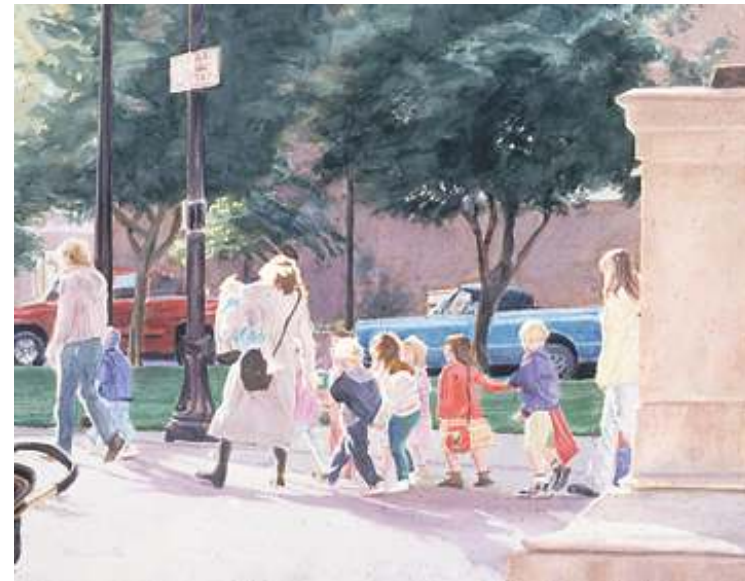
Paul Scott , Portland Day Care Outing: Park Blocks , 20 x 26, $500