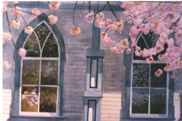
Kathryn Honey, Corvallis Spring Blossoms , 14 x 20, $450