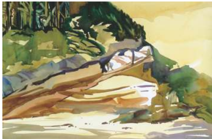
Carolee Clark, Philomath Cummins Creek , 14 x 21, $500