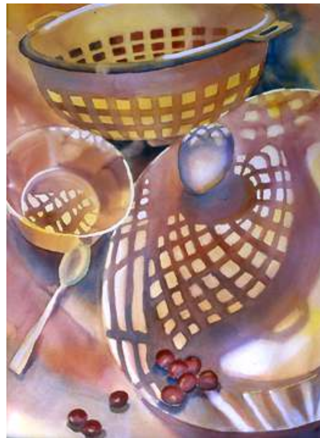
Nancy Block, Medford Kitchen Patterns , 26 x 20, $925