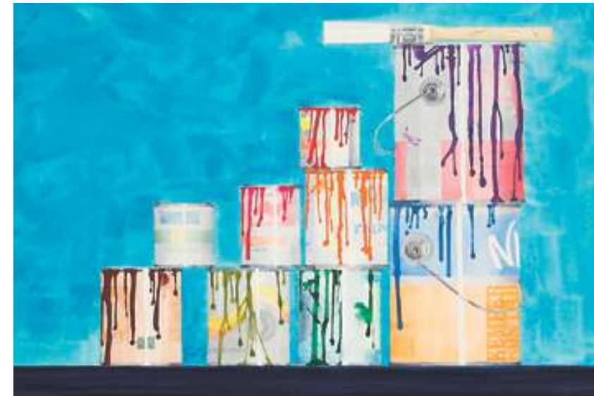
Kemper Rostad Wilsonville Paint , 19 x 26 $600