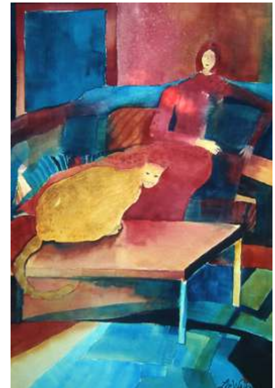
Liz Walker, Portland Sofa Seat No. 5 , 26 x 20, $700