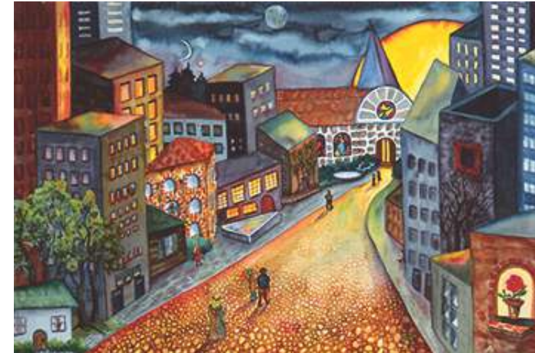
Lynne Taylor , Gaston Searching for the Light , 15 x 22, $650