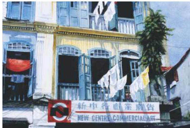
Virginia Imbler, Eugene Back to Bangkok , 15 x 22, $650