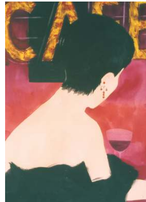
Carol Winchester, Portland Night Out , 24 x 18, $600