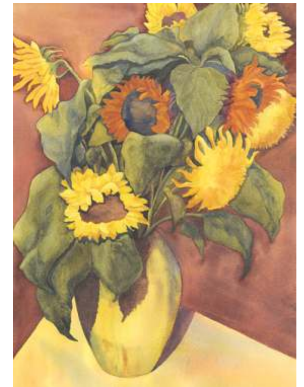
Lynda Haghan, Medford Sunflower Spectacular , 21 x 28, $450