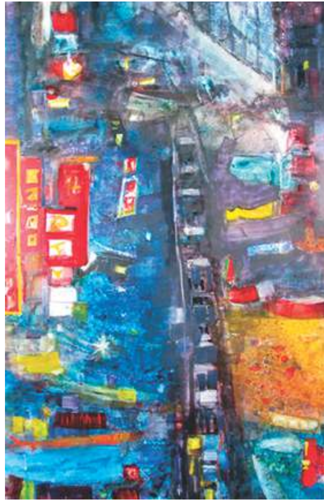
Bruce Ulrich, Beaverton Oriental Nights , 40 x 26, $1200