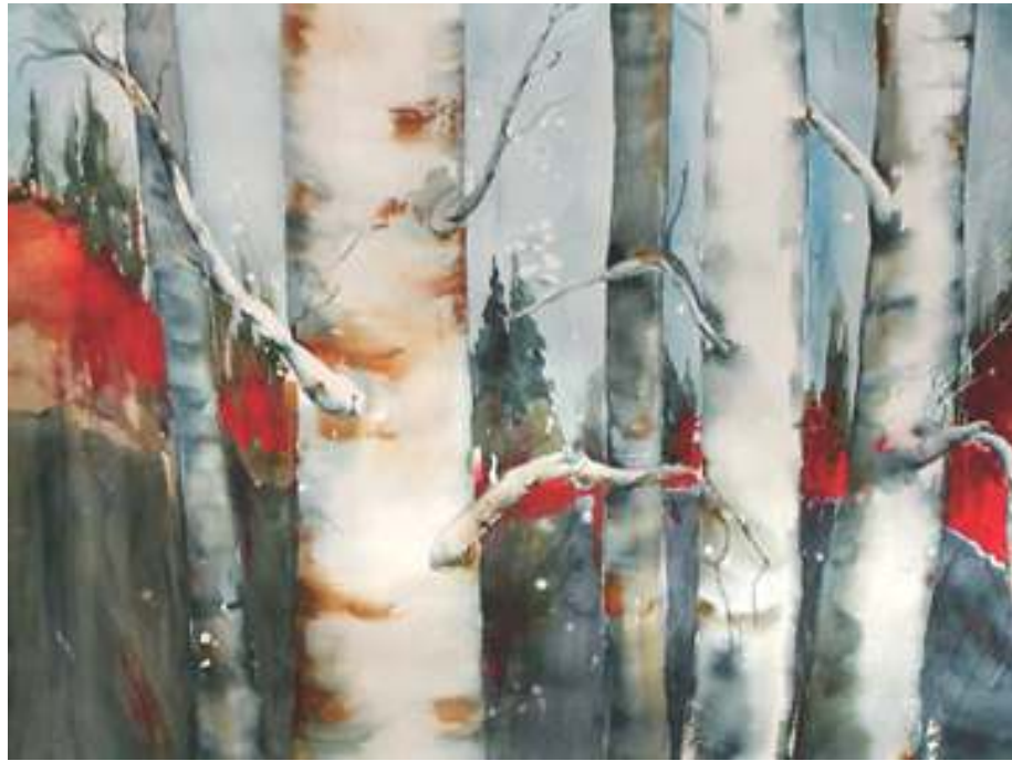
Gerry Boyer Oregon City Red Sky Behind Alders 22 x 29, $450