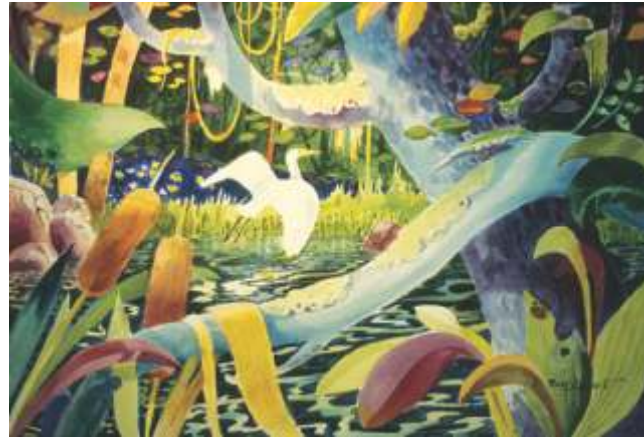
Buzz Stewart Brookings Egret in a Landscape 16 x 22, $550