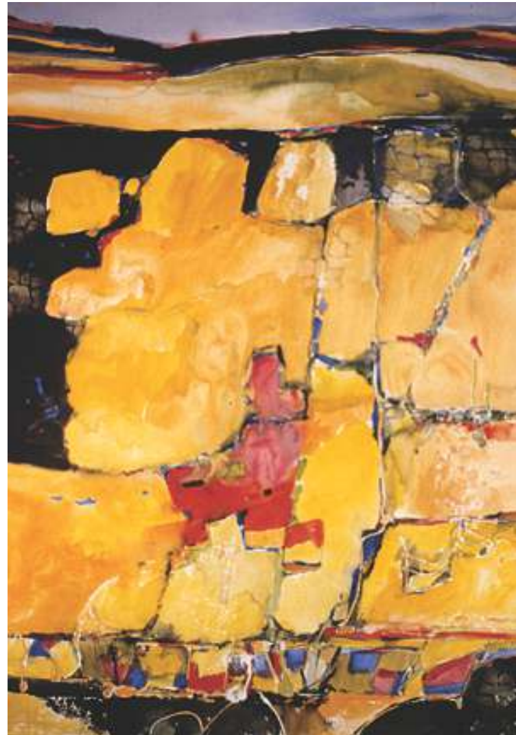
Judy Hoiness, Bend Western Landscape I 30 x 22, $1000