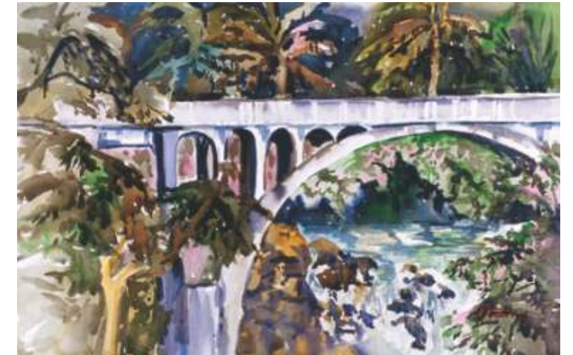
Margaret Godfrey, Blue River Honolii Bridge II , 14 x 20, $700