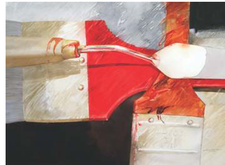
Linda Rothchild-Ollis, Scappoose Old Friends 1 , 21 x 28, $1000