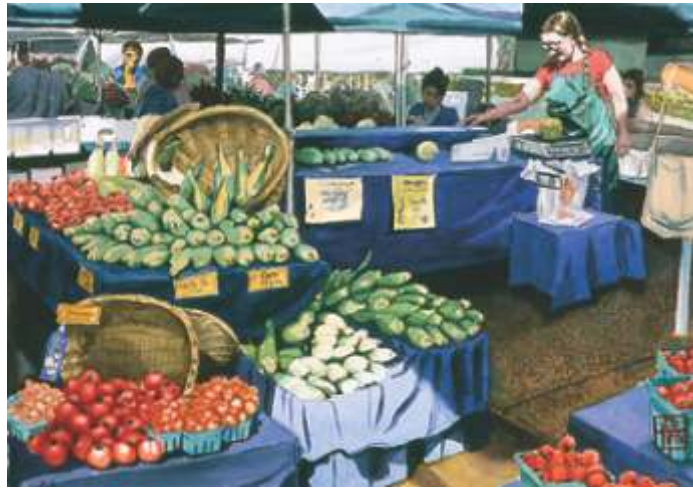
Ed Tryk, Eugene Selling Veggies at Saturday Market , 22 x 30, $1600