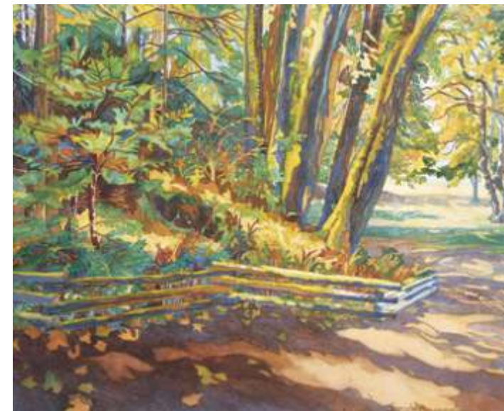
Sarah Bouwsma, Portland Beach Trail , 17 x 21, $825