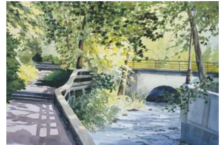
J.C. Whitsett, Ashland Guanajuato Way #2 , 14 x 21, $400