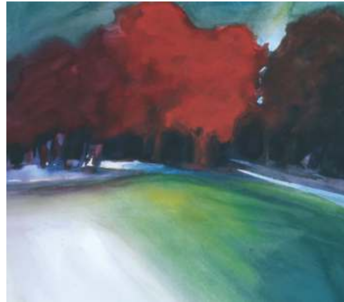
Dolores Ribal, Central Point Red Trees , 21 x 22, $1500