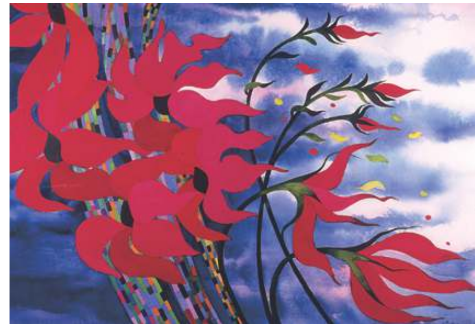
Ray W. Thompson, Shady Cove Red Wind , 20 x 28, $700