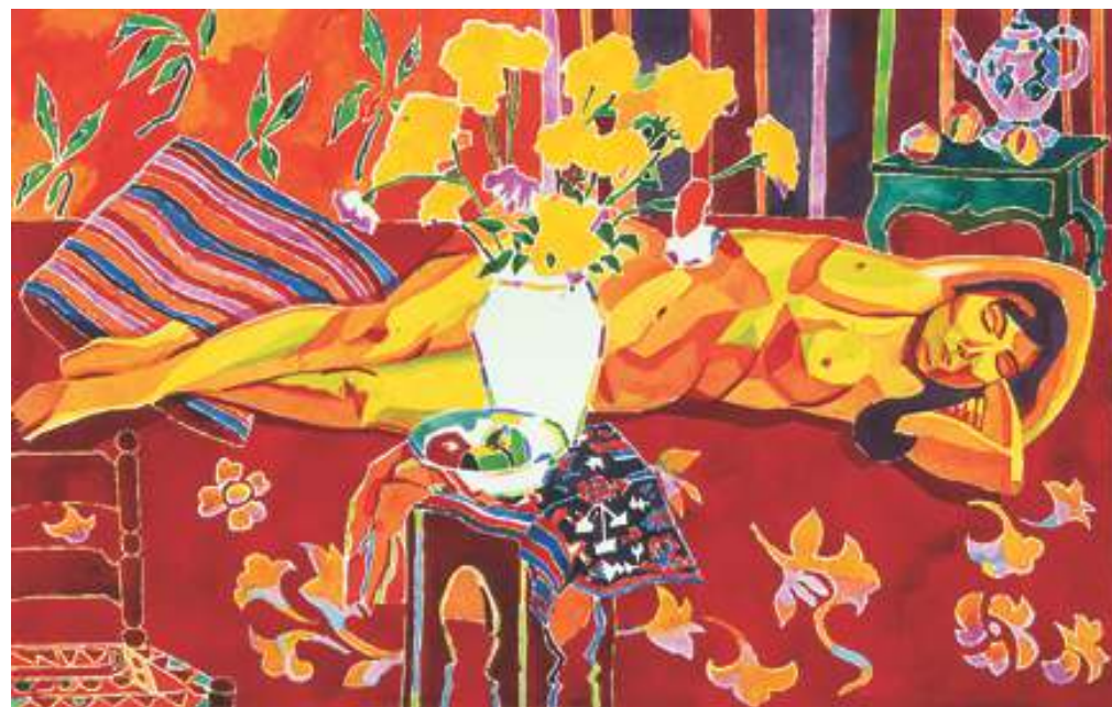
Preecha Promprabtuk Sherwood Colour and Dream 19 x 30, $1500