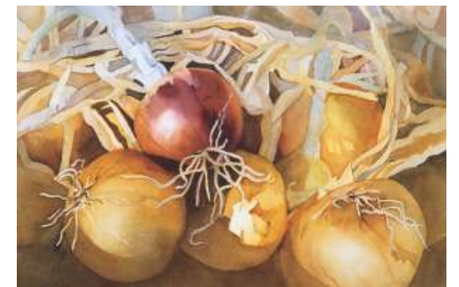
Sally Schwader, Eugene Alyse's Onions , 13 x 19, $495