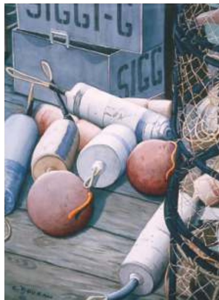
Constance Dougan Beaverton Crab Dock , 22 x 17 $700