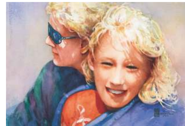
LaVonne Tarbox-Crone Eugene Approaching Alcatraz 14 x 21, NFS