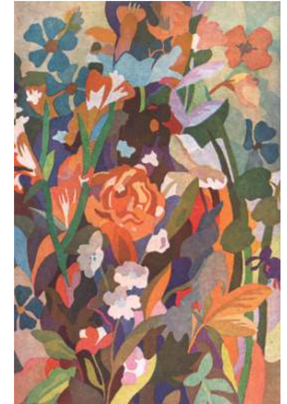
Linda Terhark , Lake Oswego Grandma's Roses , 22 x 19, $650