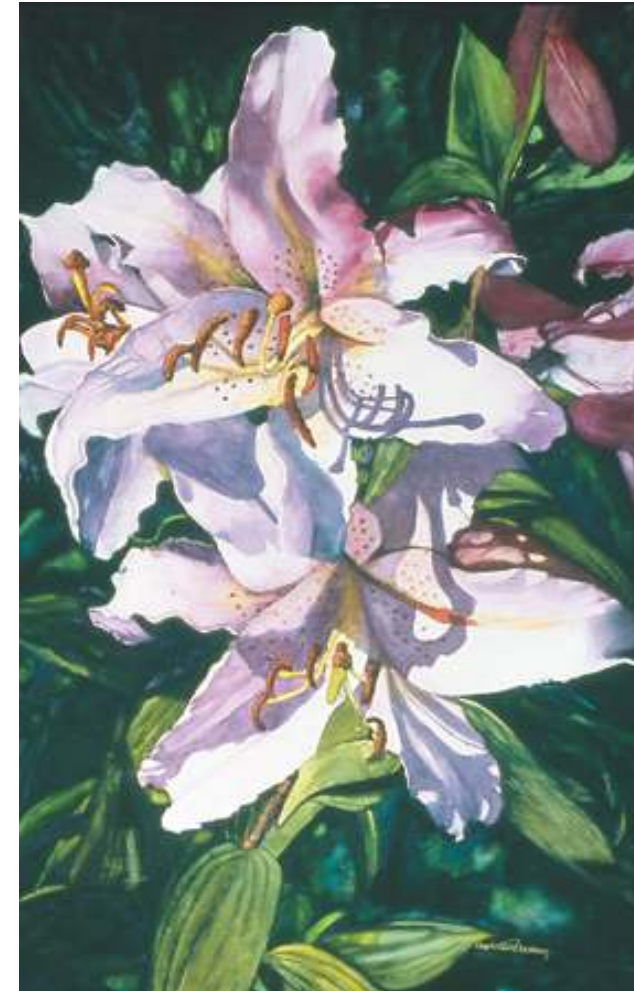
Charlotte Peterson , Central Point Ladies in Pink , 30 x 20, $1500