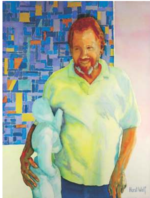
Horst Wolf Brookings The Sculptor 30 x 22, $900

The Opening Reception was held at the Buiscuit Gallery in Gold Beach.