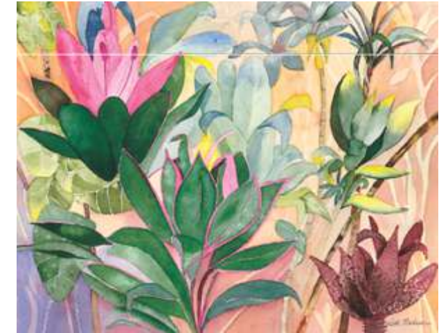
Ruth Nadeau , Ashland Aloha , 16 x 20, $350