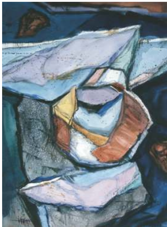
Ted Vaught, Portland Jeweled Rock Wall , 29 x 21, $985