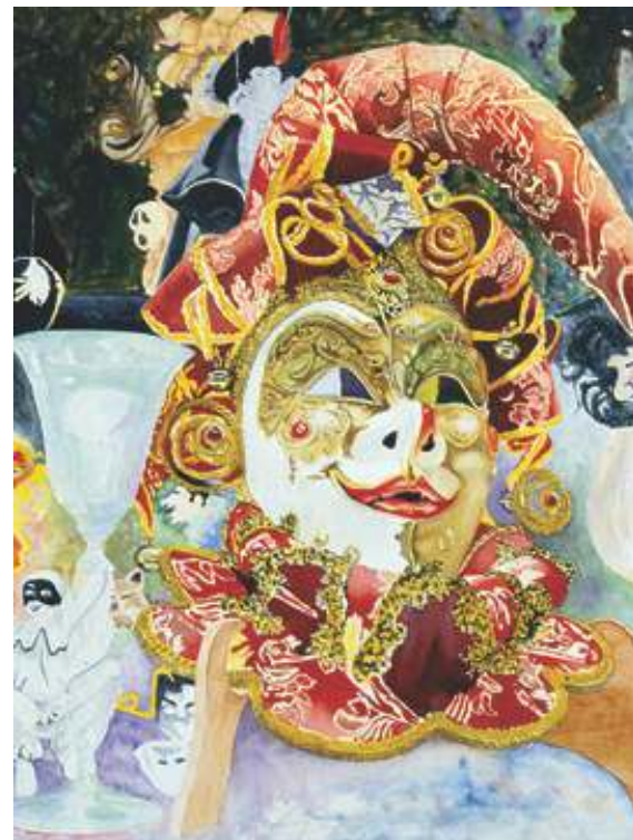
Stephen Ferris, Portland Let The Good Times Roll , 23 x 17, $1000