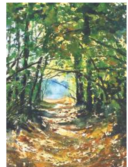
Renee Lin Hillsboro Summer Trail 15 x 11, $300