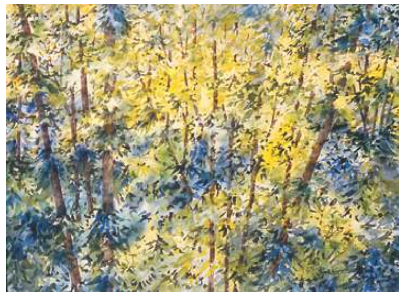
Linda Boutacoff Medford Woodland Melody 21 x 29, $1100