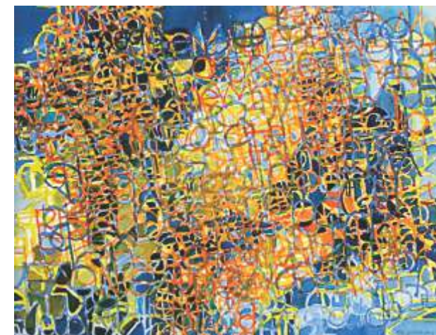
Vera Grosowsky Eugene Hearsay , 13 x 17 $250