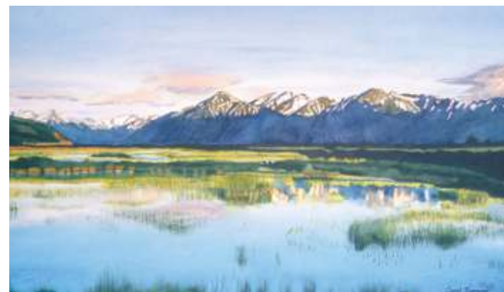
Carol Putnam Tigard Grand Reflection 11 x 19, $350